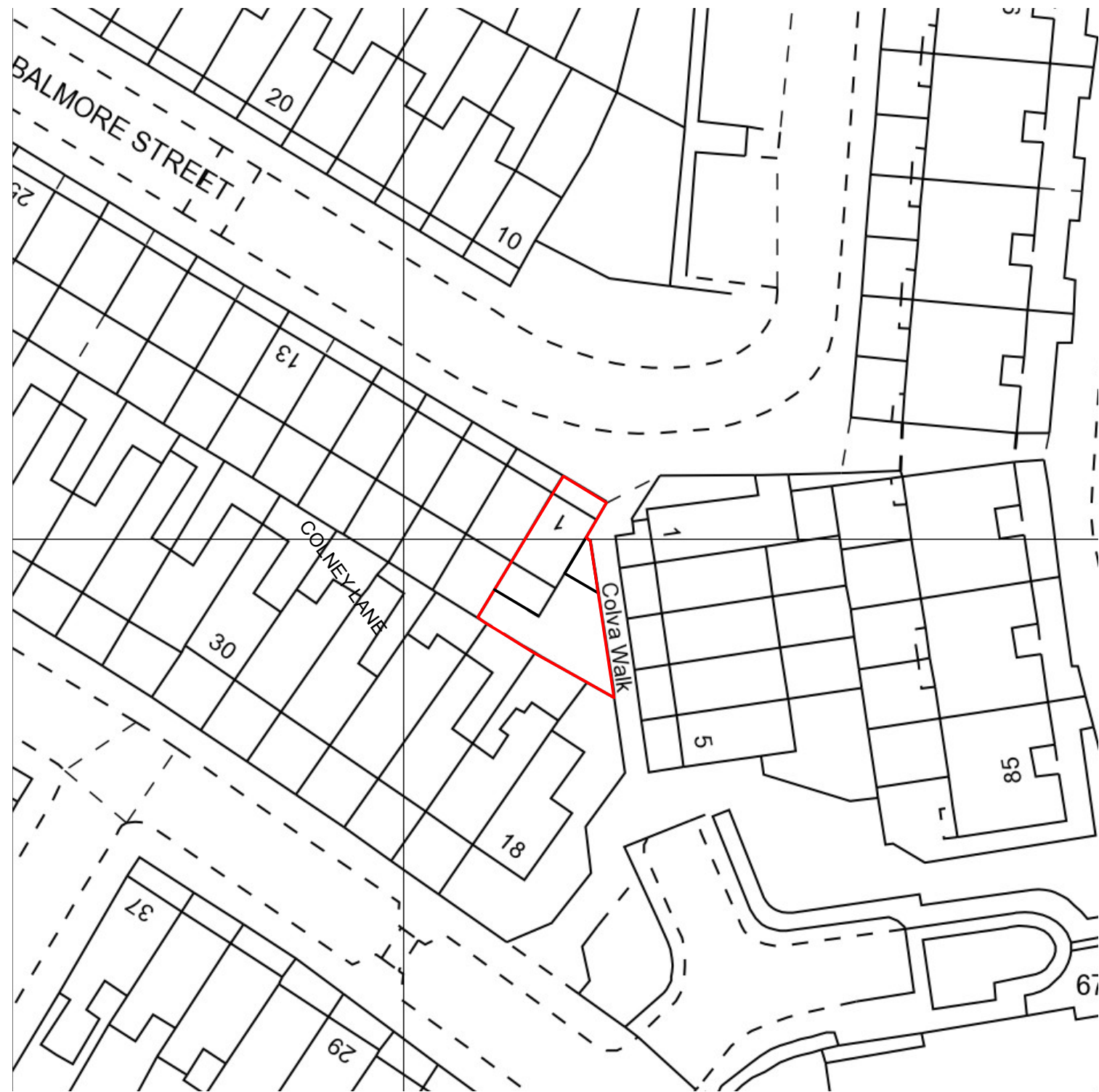
0 10 20m 1:500