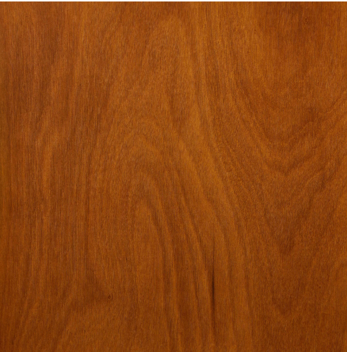
Parklex Veneered High pressure laminate cladding to new shopfronts - Finish Rustik Matte