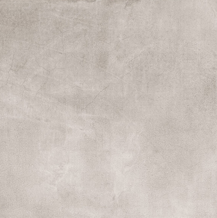
Porcelain tile to upstands - Set Concrete Pearl