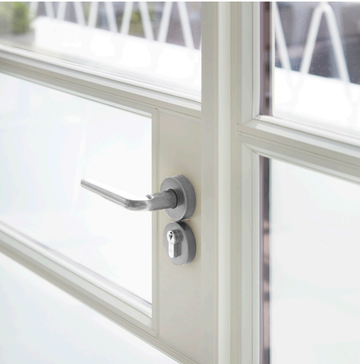
W40 Steel Window and Steel Door frames - RAL 9010 Stainless Steel ironmongery