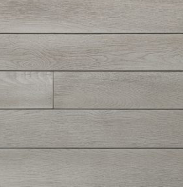
Composite timber decking - Smoked Oak