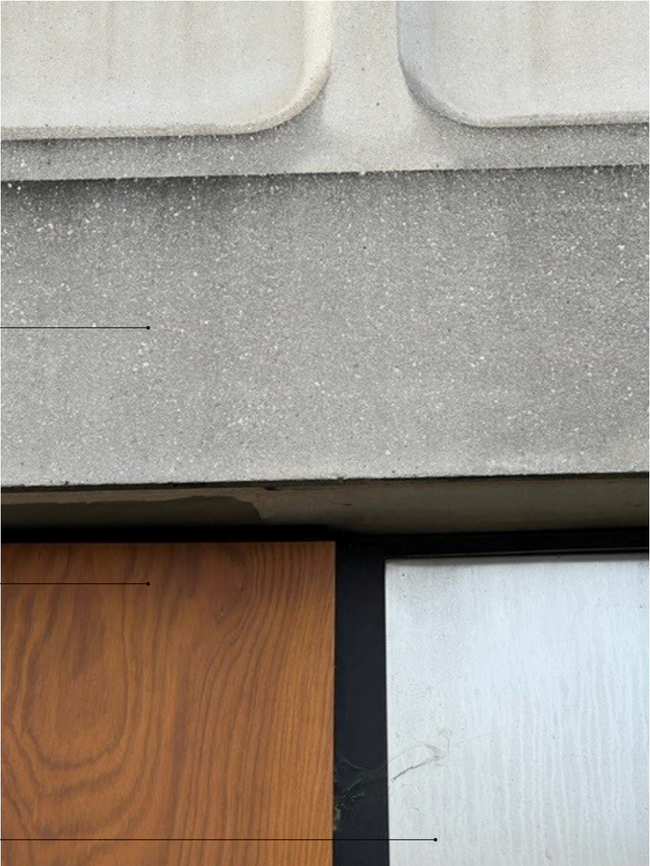
Photo of sample taken on site