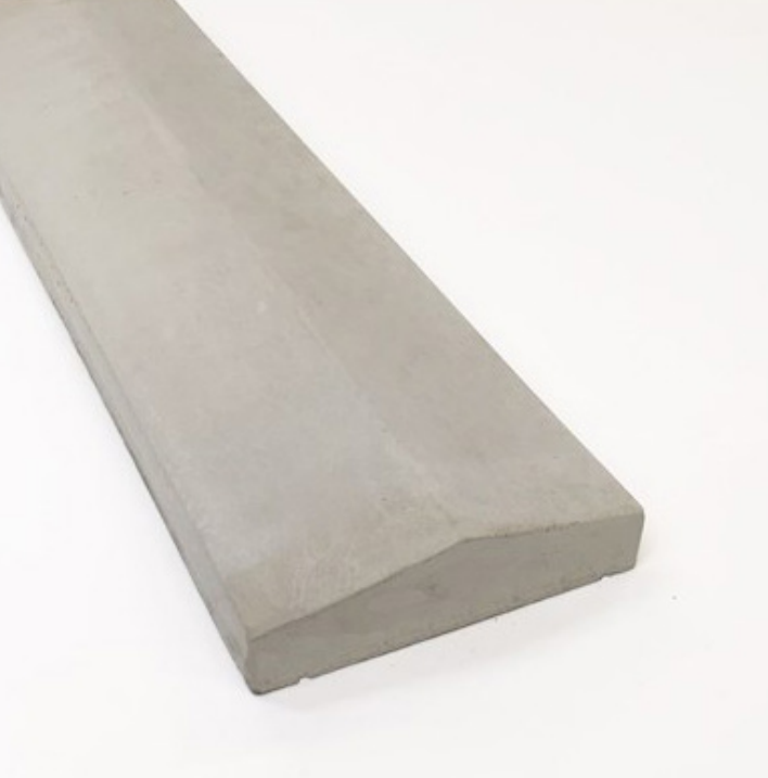
Concrete coping replacement