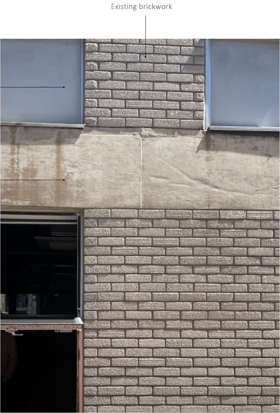
Photo of existing rear facade