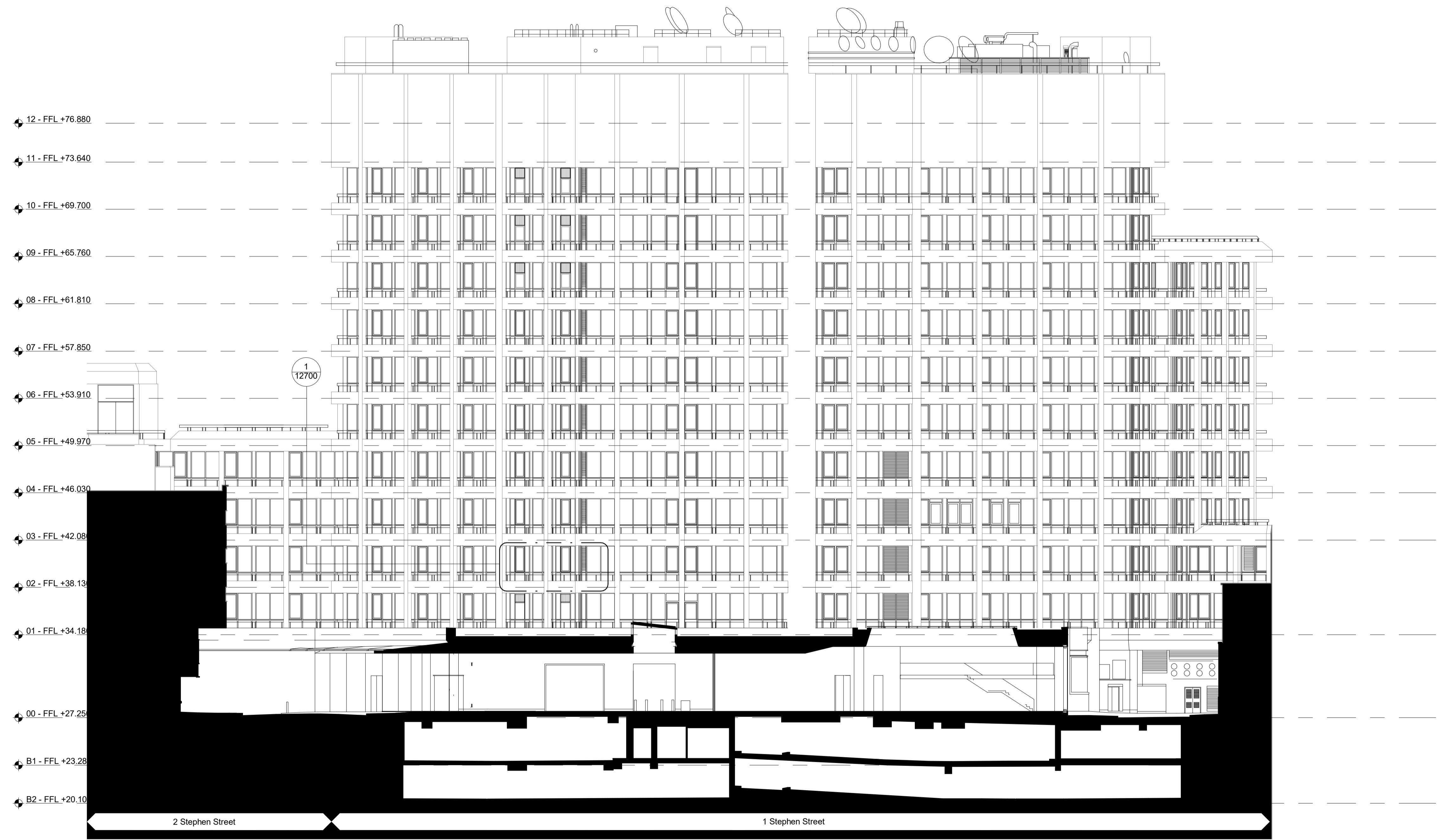
1 Existing South West Elevation - Planning Scale: 1 : 200