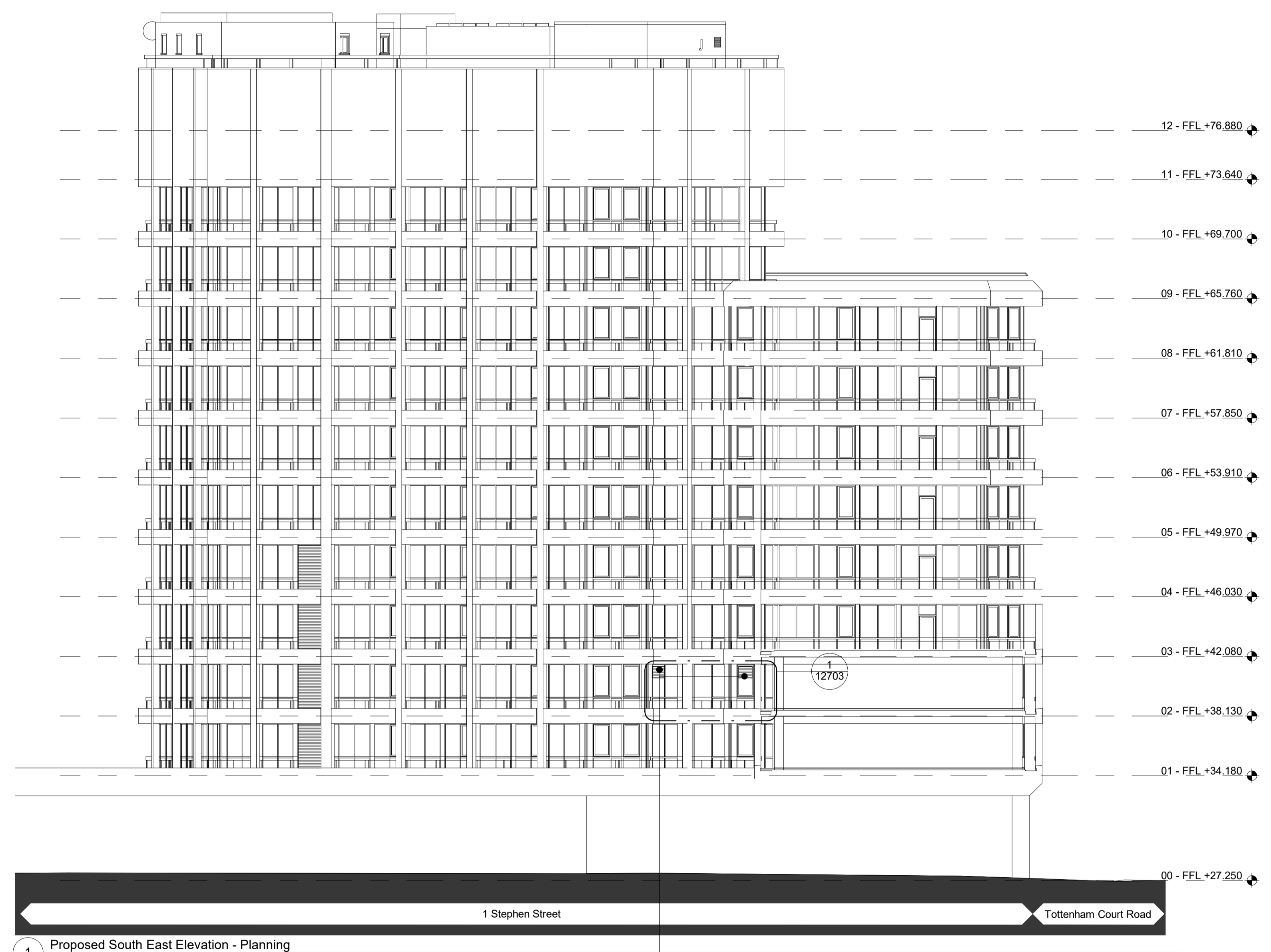
1 Proposed South East Elevation - Planning Scale: 1 : 200

Proposed new louvres to serve new internal air handling units