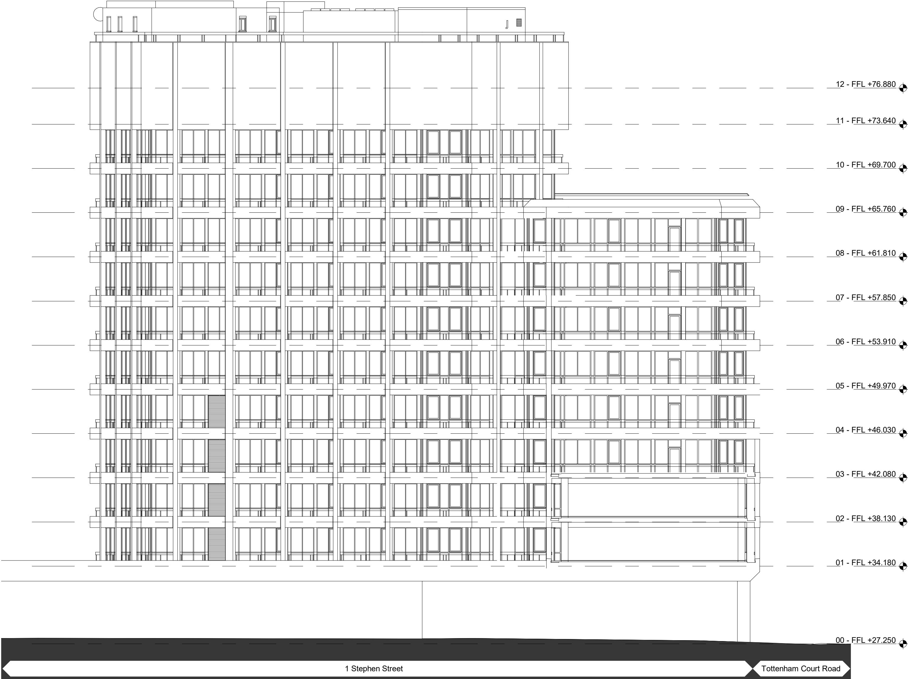
1 Existing South East Elevation - Planning Scale: 1 : 200