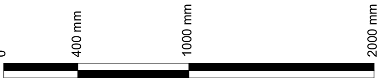
1 Planning - Existing South West Elevation Second Floor Scale: 1 : 20