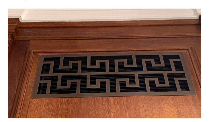
New patinated brass ventilation grille to the first floor democratic spaces