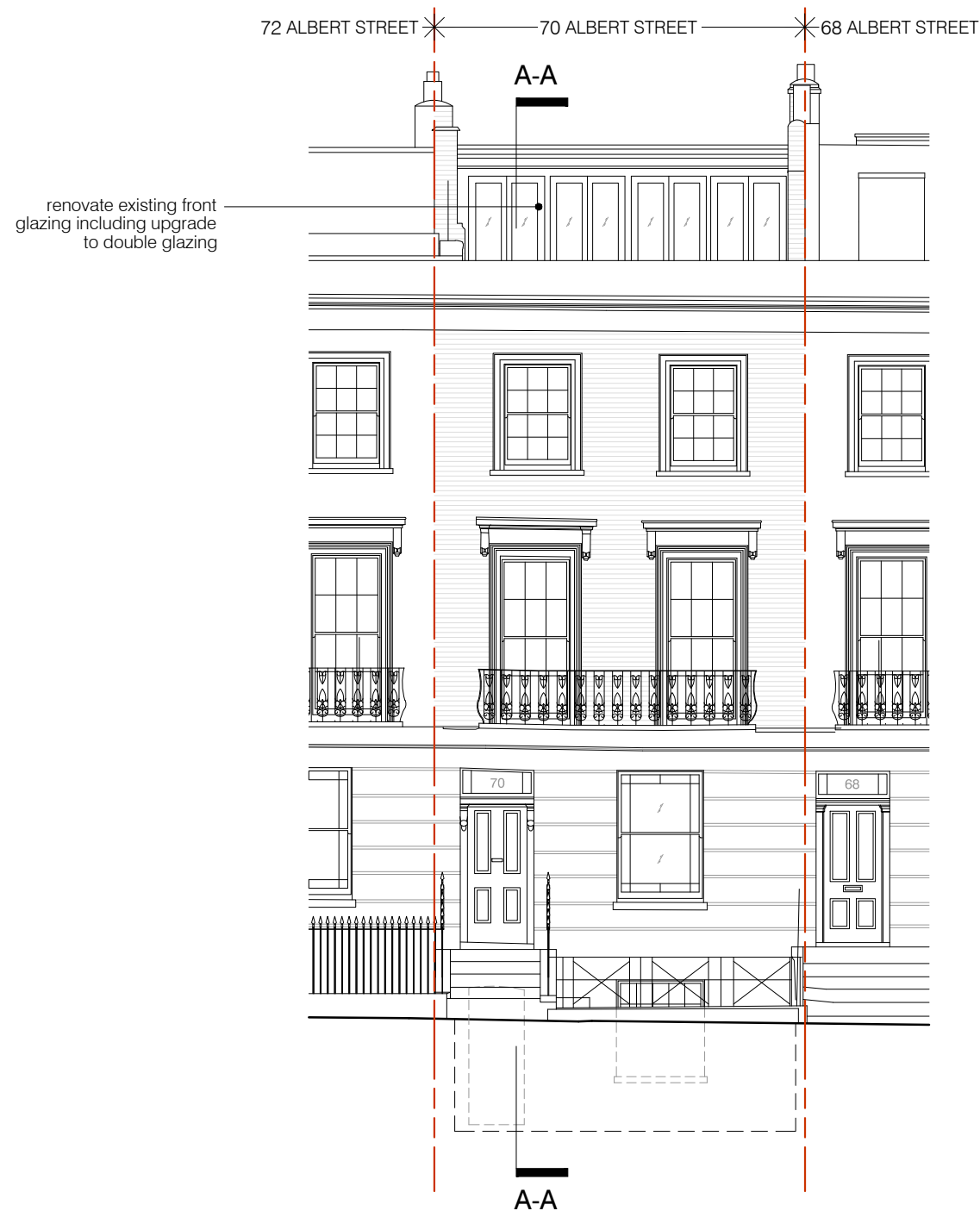
01 PROPOSED FRONT ELEVATION scale 1:100