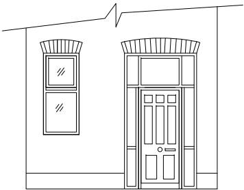
Existing LGF Elevation 1

Notes This drawing must not be scaled. Use figured dimensions. All dimensions are to be verified and checked on site. Any discrepancies that are, or become apparent should be reported to Tom Bestwick. This electronic data has been prepared, in part, from archived hand drawn material and is indicative only. The envelope setting out is based on Ordnance Survey information. It must not be taken to represent contract documentation, nor as evidence of any legal boundary or status.