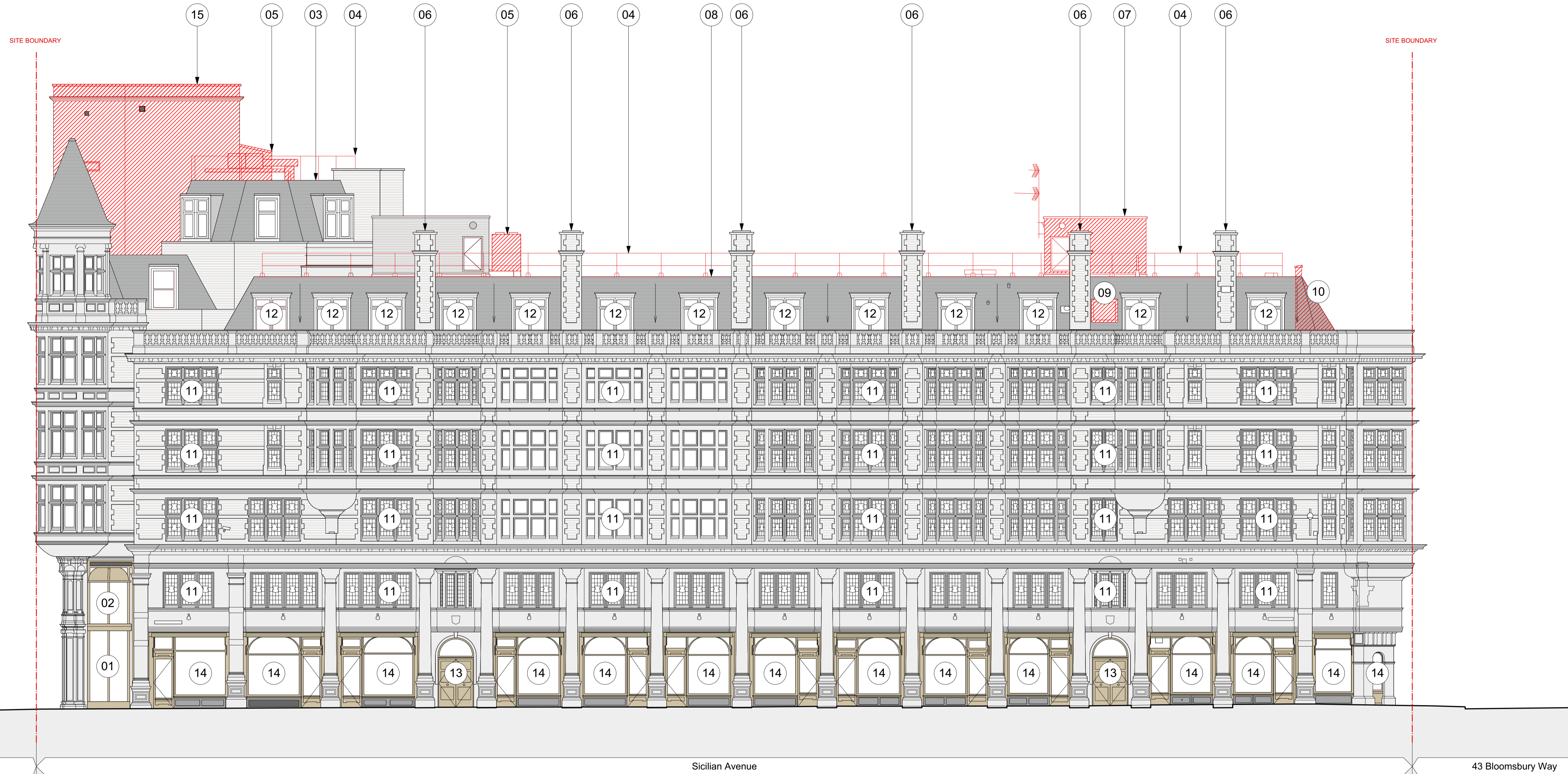
1 Vernon & Sicilian House Demolition North East Context Elevation Scale: 1:100