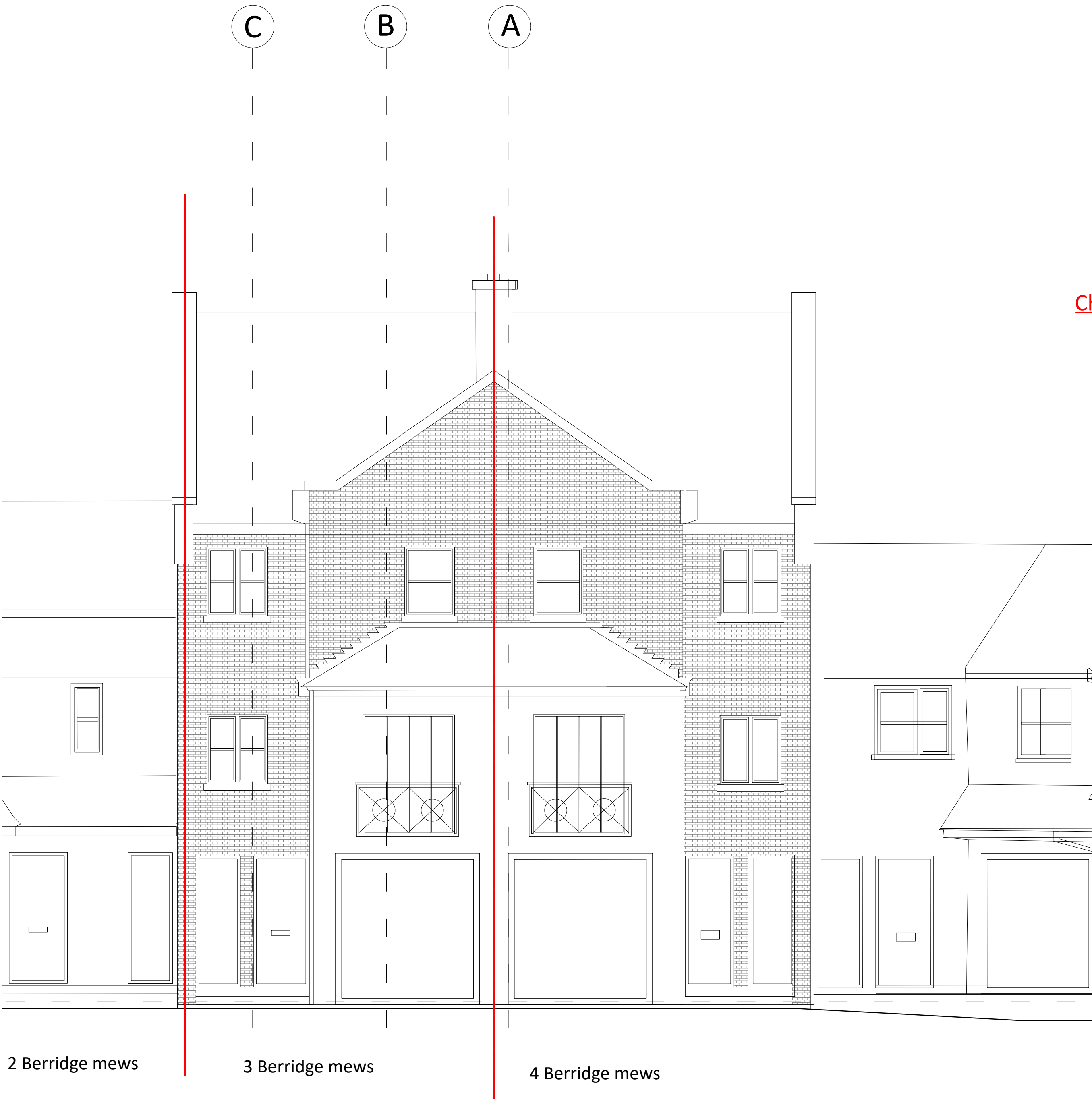
1 Proposed Elevation Proposed Elevation B_B 1:50

Proposal: Proposal to change all window to match existing windows, frame of window to match timber existing painted timber frame. Proposal to change door 1D 04 Juliet balcony to doubled glazed painted timber frame to match existing.