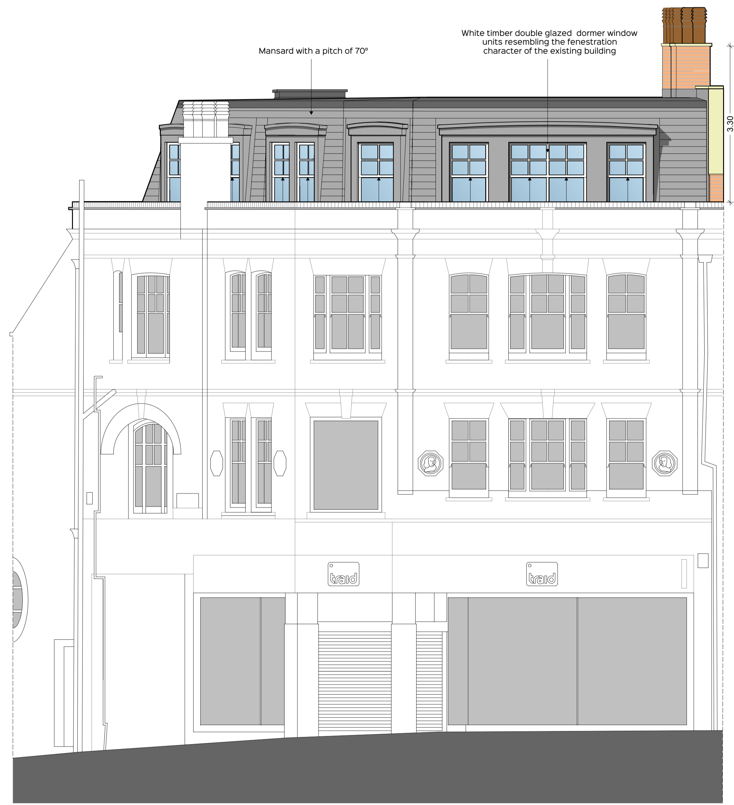
Proposed South-West Elevation (scale 1:50)