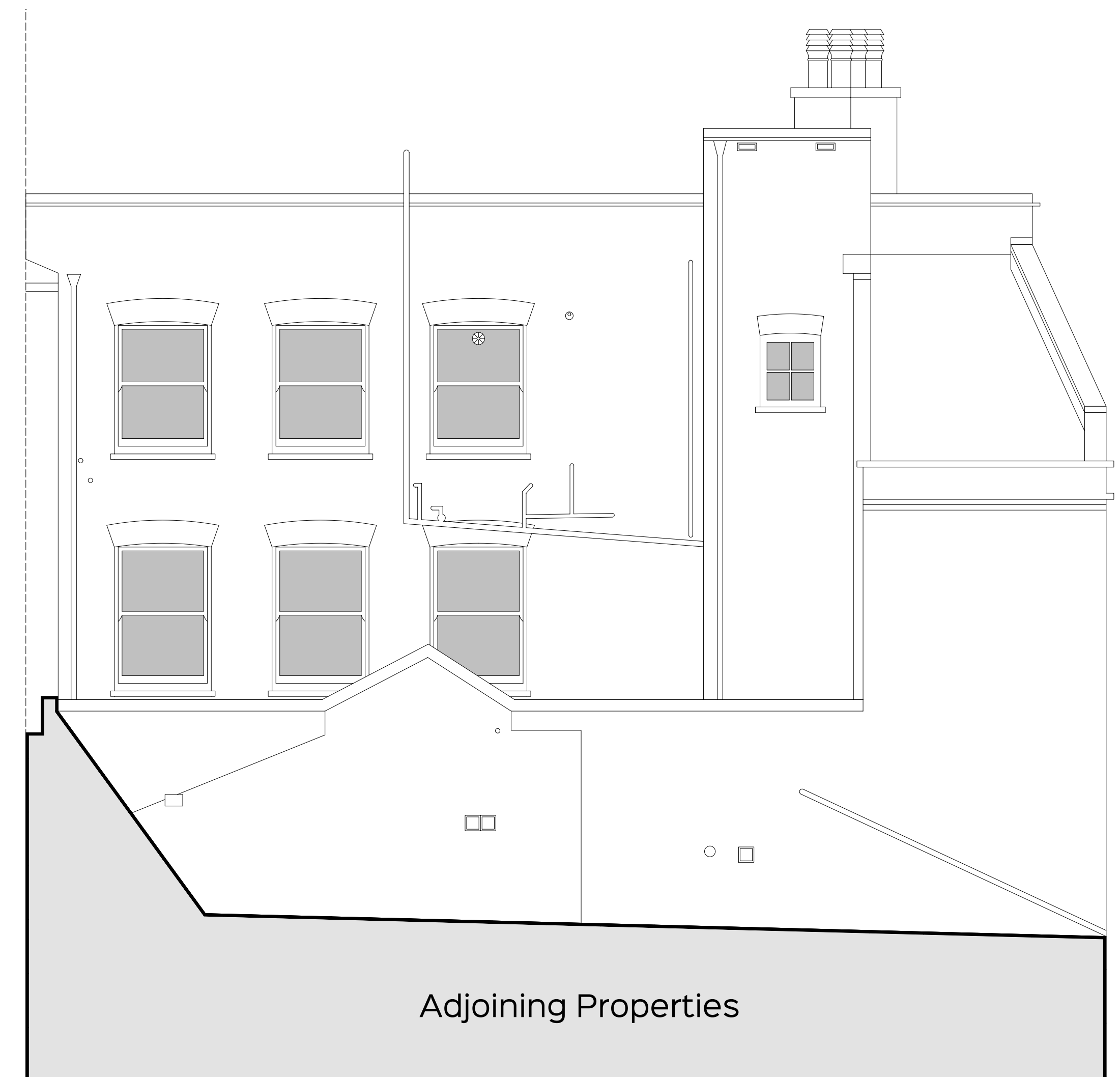
Existing North-East Elevation (scale 1:50)

Survey information provided by iG Surveys Ltd.