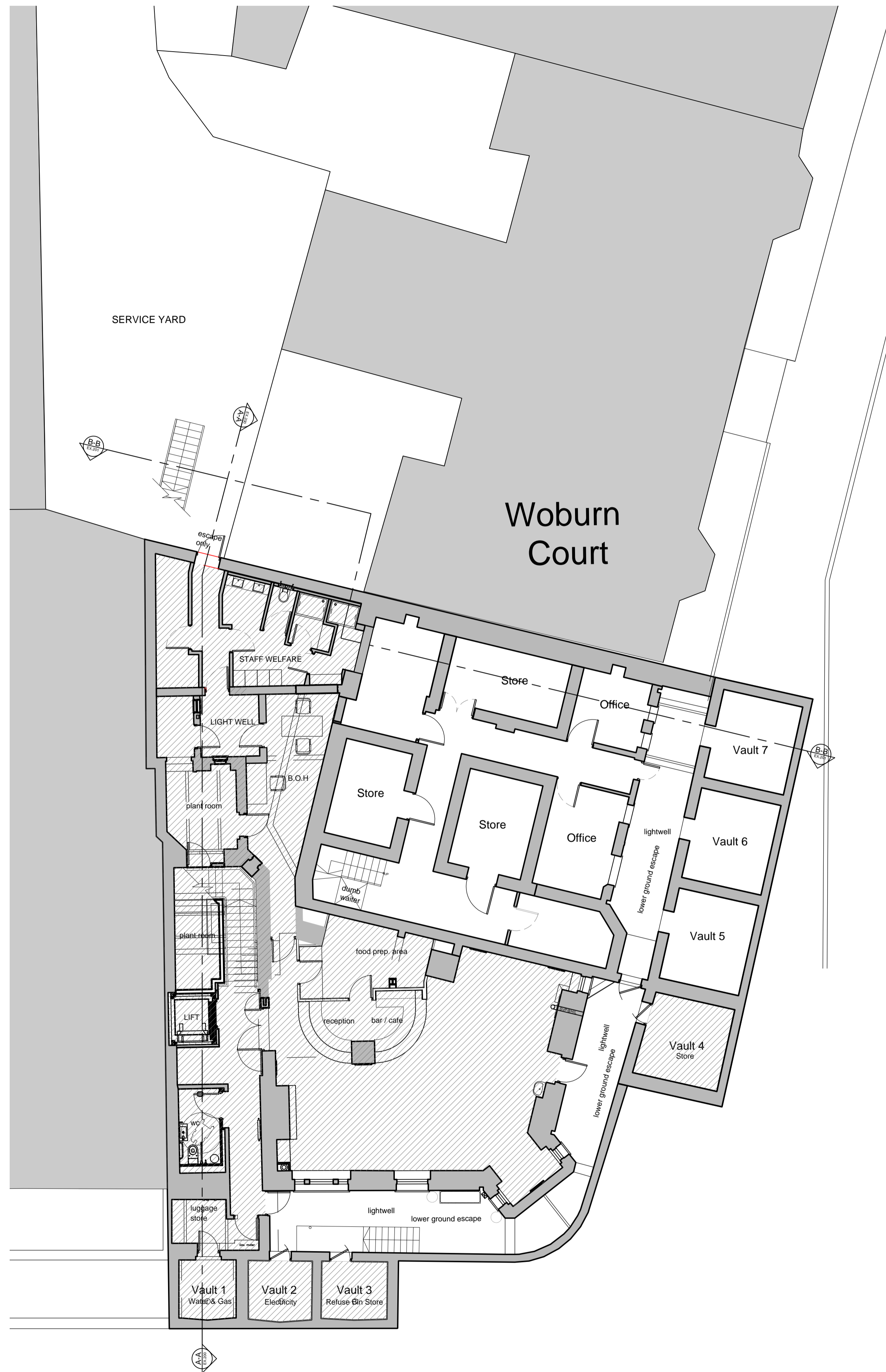
EXISTING BASEMENT FLOOR PLAN Level - 1 Scale 1:100