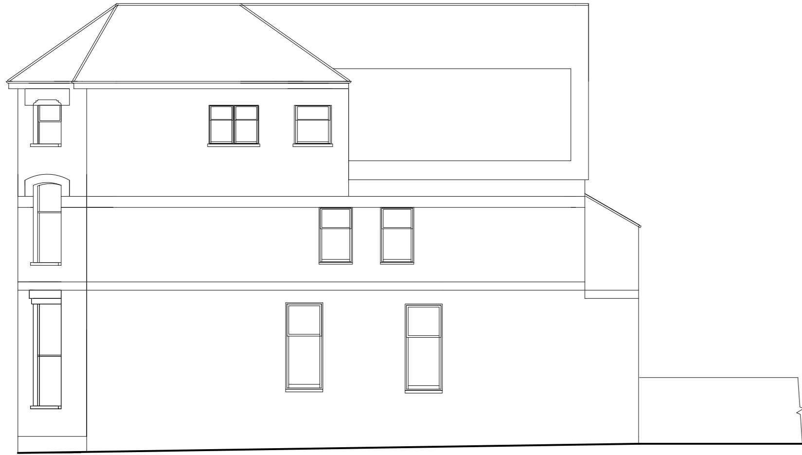
EXISTING SIDE ELEVATION (NORTH)