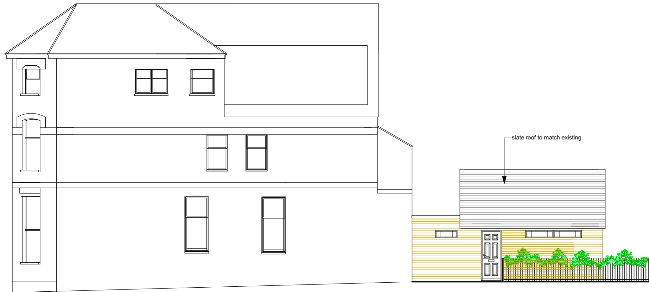
PROPOSED SIDE ELEVATION (NORTH)