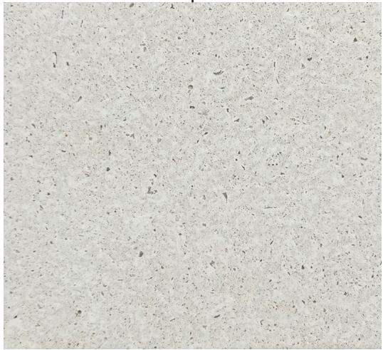
Precast concrete banding: As sample