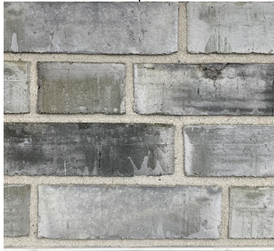
Brickwork: Petersen Tegl D91, english garden wall bond, light grey semi recessed pointing.