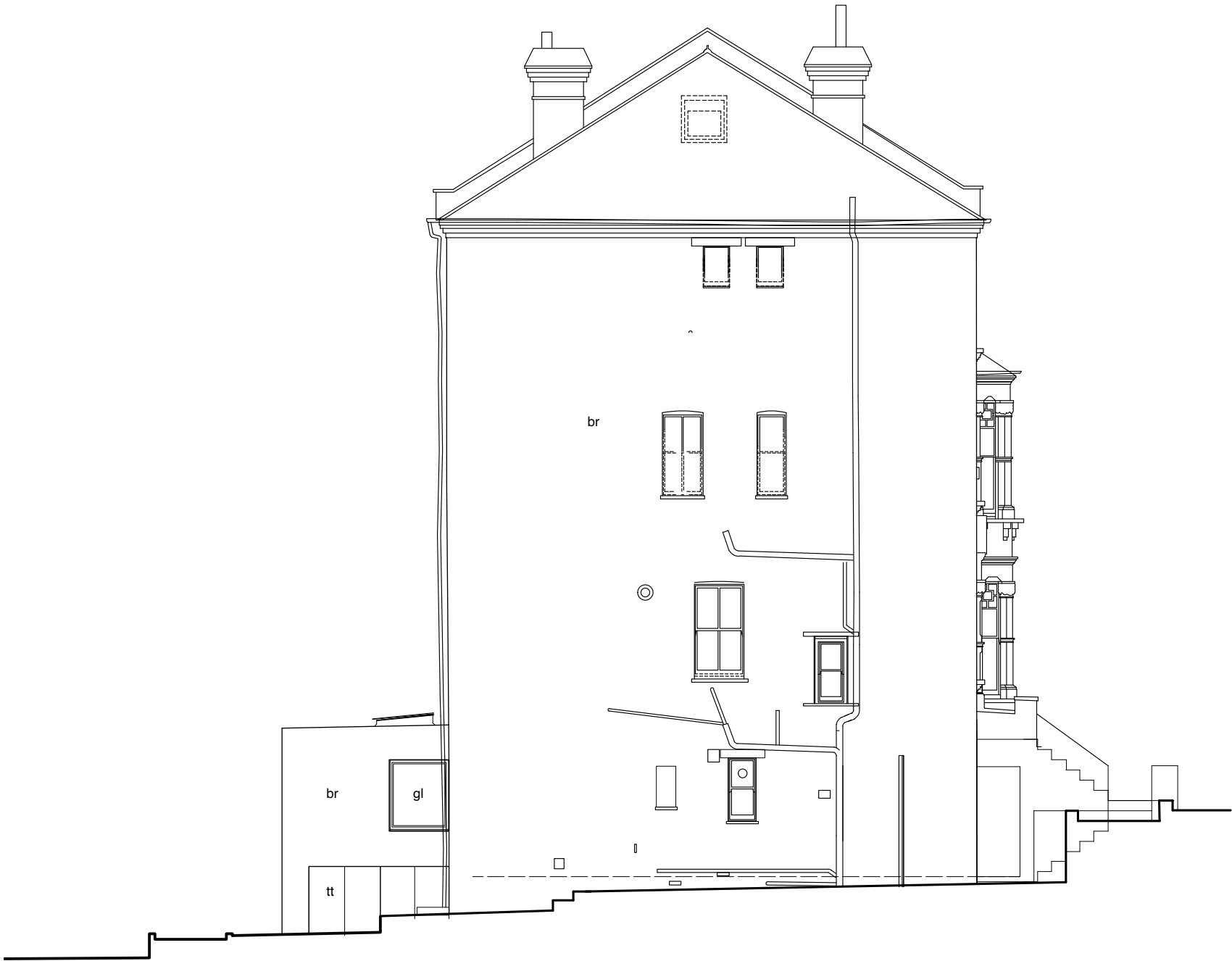
01 | Side Elevation - PROPOSED scale 1 : 100