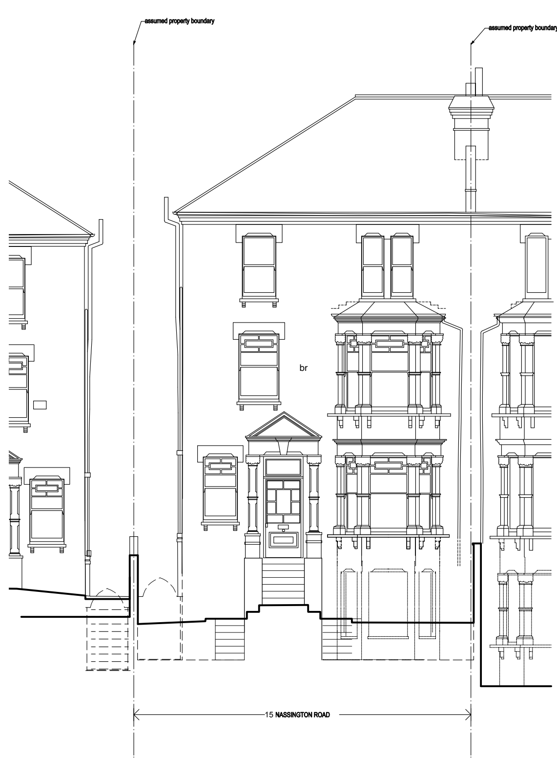
01 Front Elevation - EXISTING scale 1:100