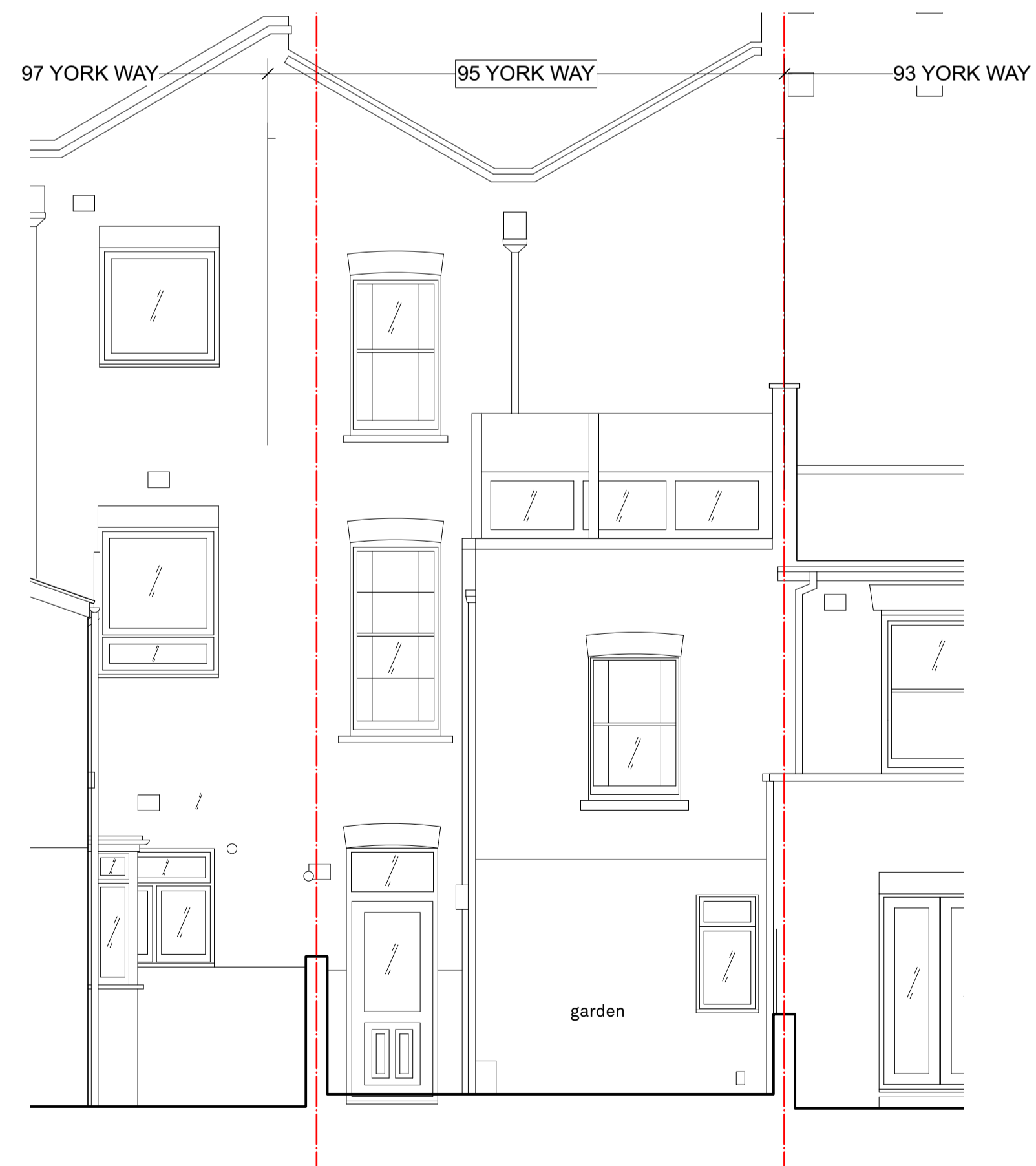
3 EXISTING REAR ELEVATION Scale: 1:50 @ A1 / 1:100 @ A3