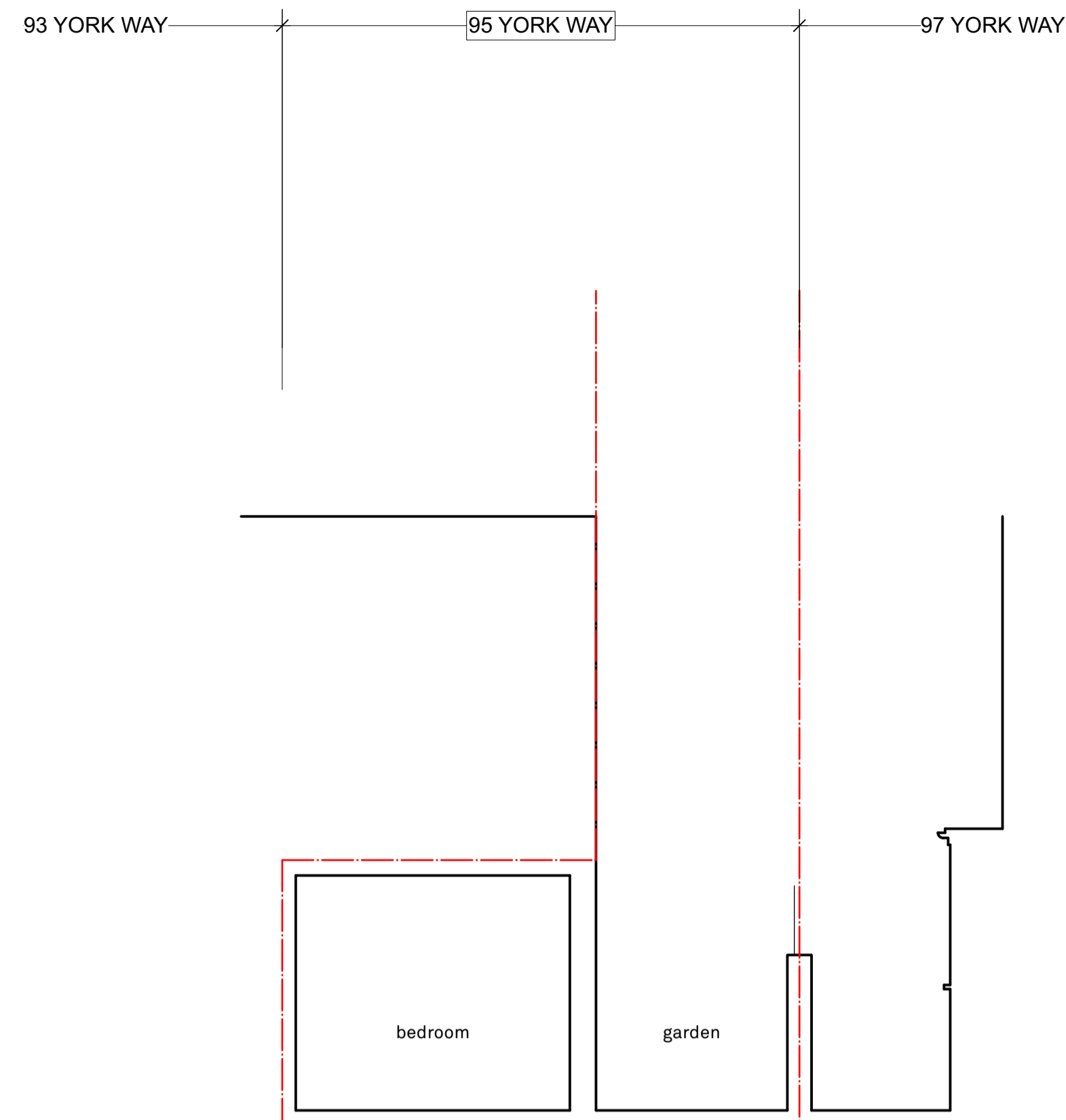
1 EXISTING SECTION BB Scale: 1:50 @ A1 / 1:100 @ A3