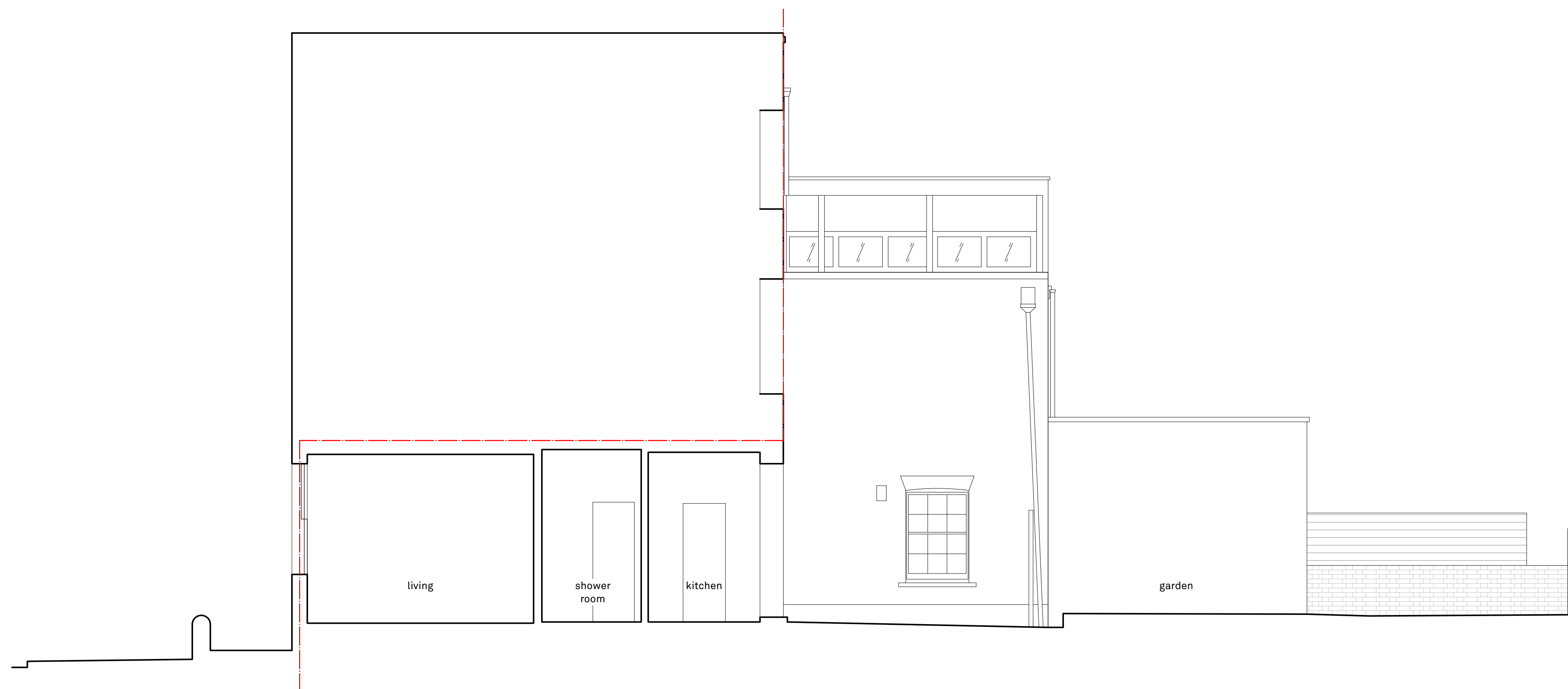
1 EXISTING SECTION AA Scale: 1:50 @ A1 / 1:100 @ A3