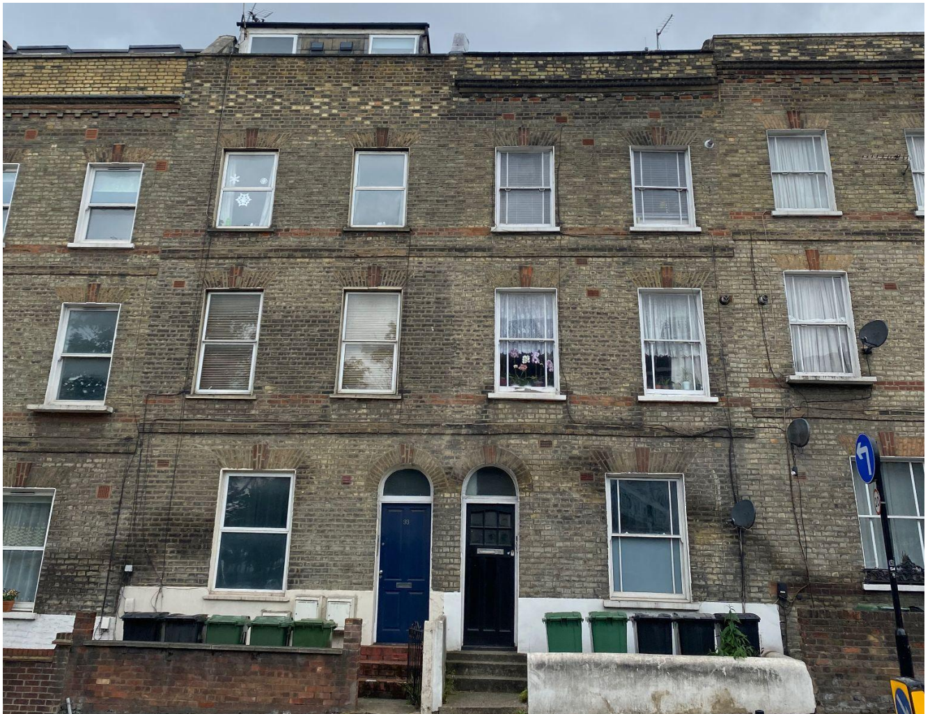
Fig.1: The front of 95 York Way (pictured with the black door)

This application follows on from application 2021/5512/P which was registered on the 29th of December 2021 and subsequently withdrawn in January 2022 following on from case officer comments. Additional underlined grey text relates to the revised application submitted in February 2023.