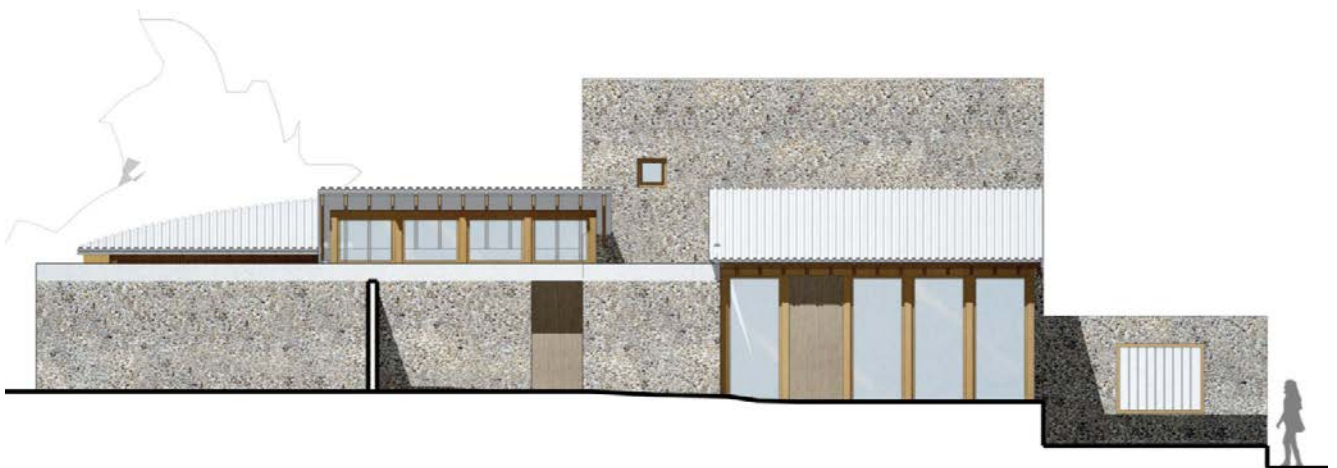
Figs. 8,9 & 10: Ashdon part-80 eco-house; Holland Park Road ground floor rear extension in a Conservation Area; Contemporary Cottage in Norfolk