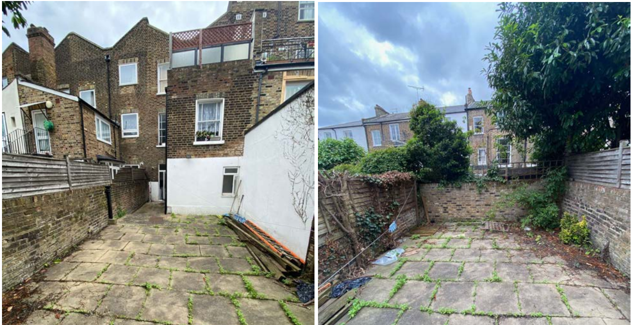
Figs.3+4: Existing views from the rear of the existing garden back towards the property and towards 76 Marquis Rd.

The patchwork and extensive development to the rears of York Way are interspersed with a variety of trees and greenery, affording views of green laterally along the rear gardens. However, the rear of 95A York Way has been latterly built up by approximately 150-200mm in concrete and paving slabs and has no greenery beyond various weeds, and is a generally unkempt condition. In its current condition 95A's garden makes little contribution to the run of rear gardens.