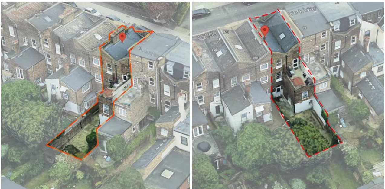
Figs.5+6: Google Earth 3D Imagery showing the rear of 95 York Way in its surrounding context.

No.97 York Way has a Laurel tree that overhangs 95A with an overall spread of approximately 9m and that has been marked on 015_DWG_02_001.