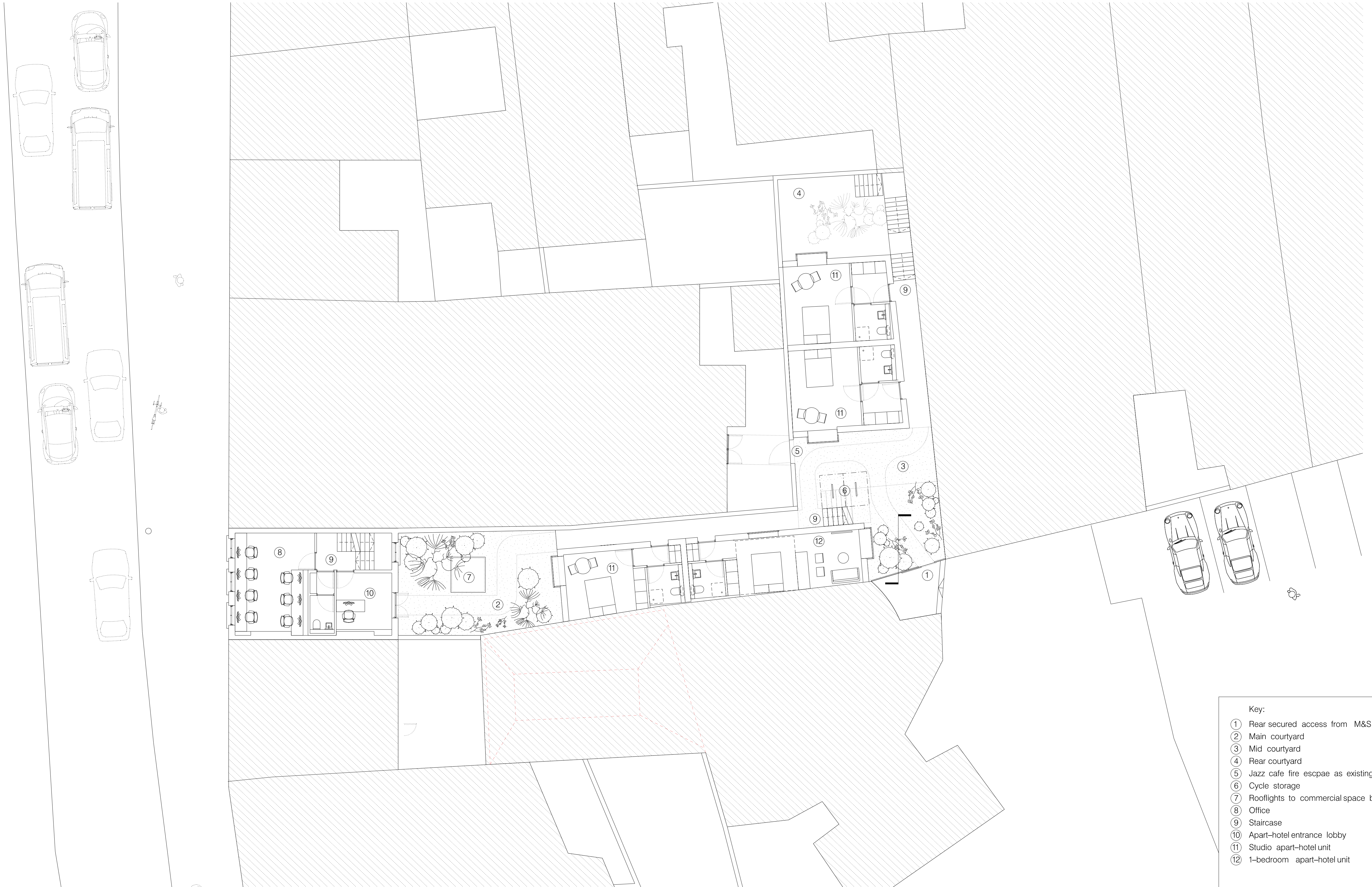
1 PROPOSED FIRST FLOOR PLAN