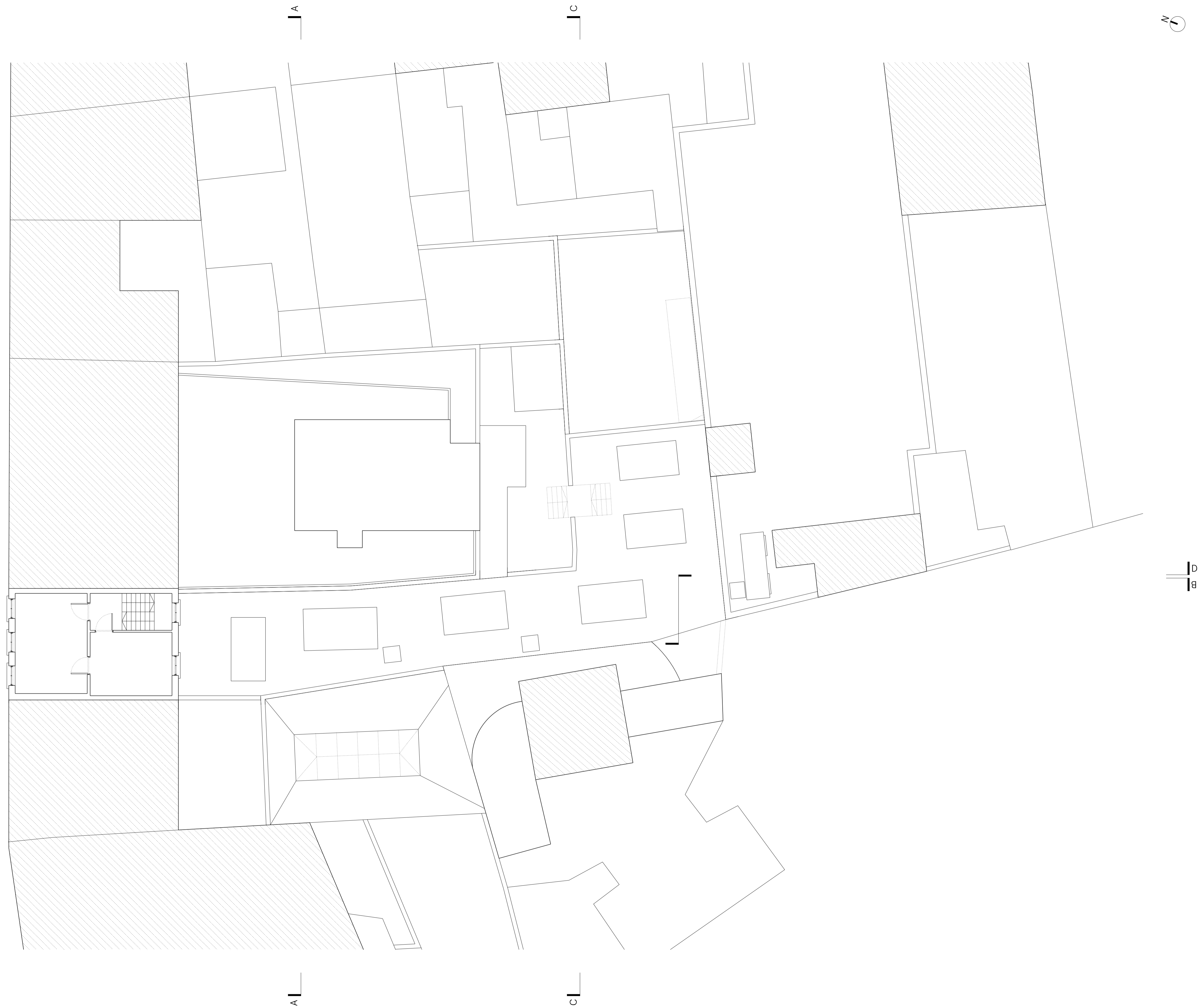
① EXISTING THIRD FLOOR PLAN