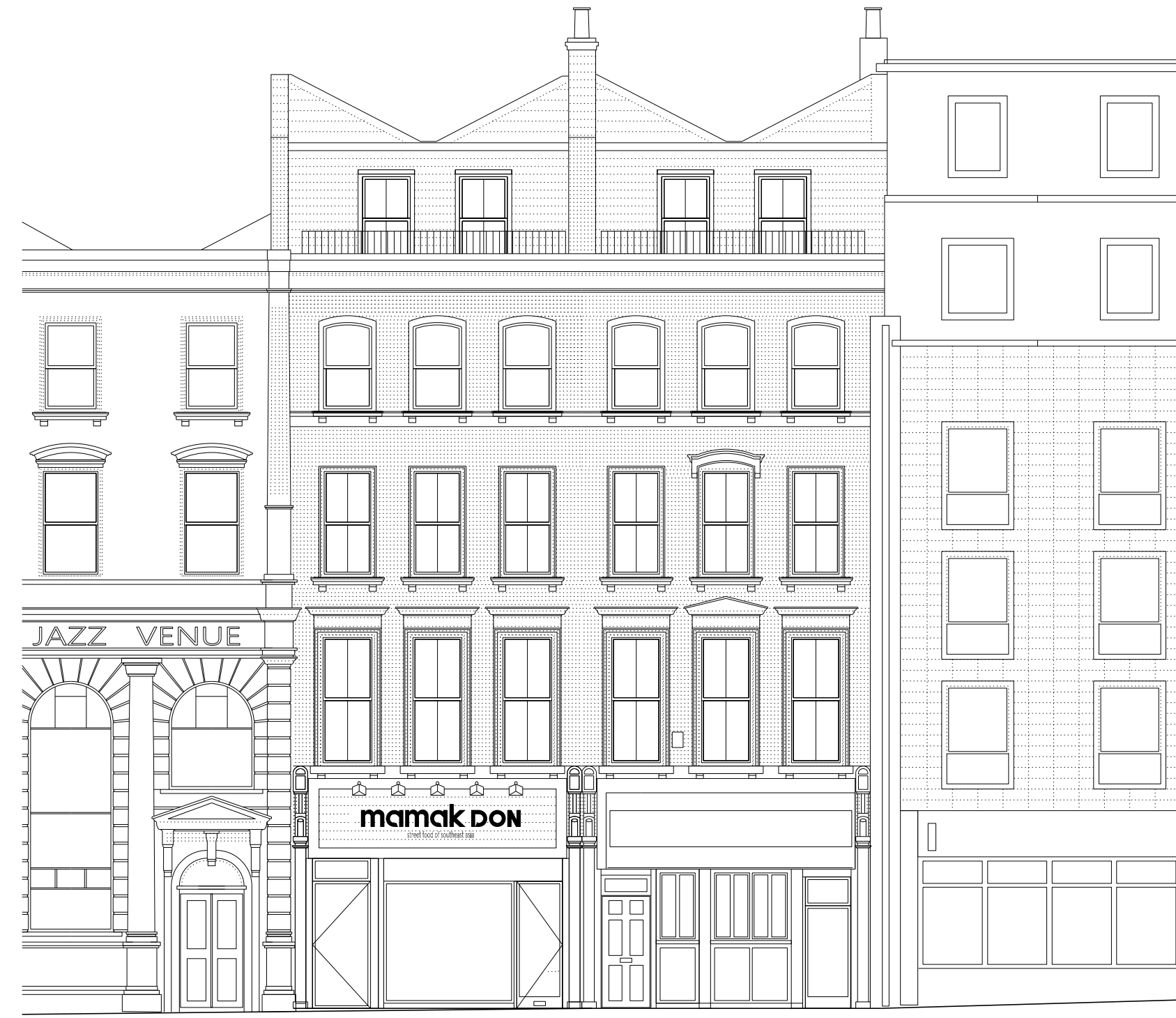
① FRONT (PARKWAY) ELEVATION