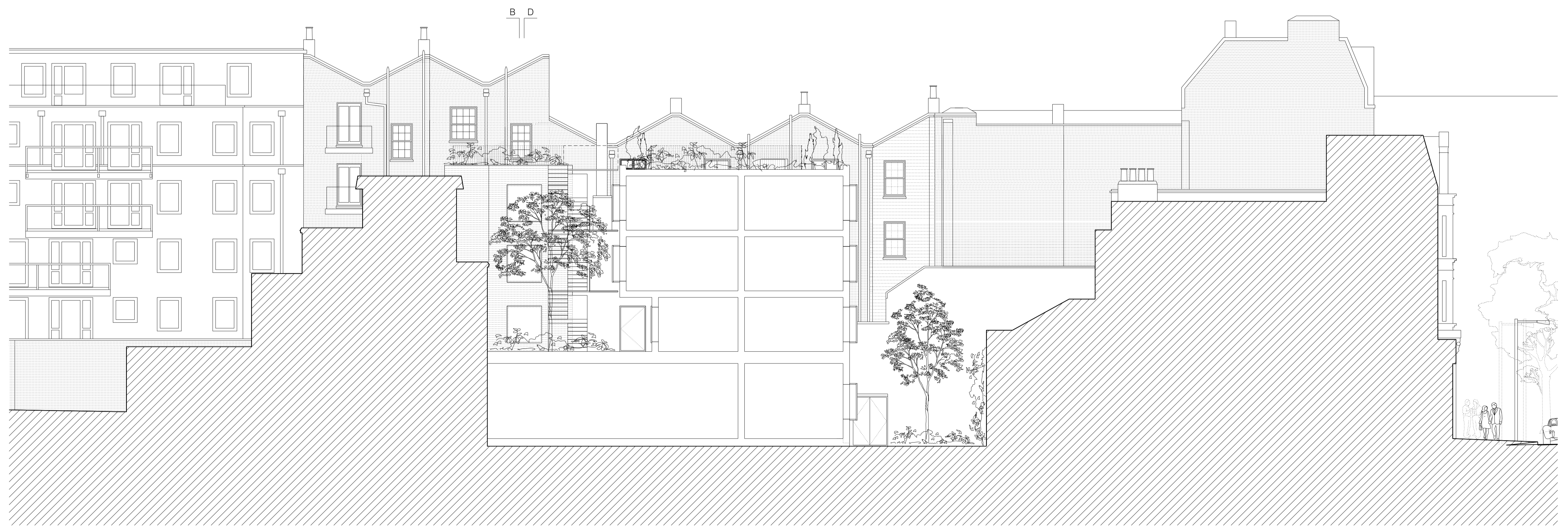
③ SECTION C