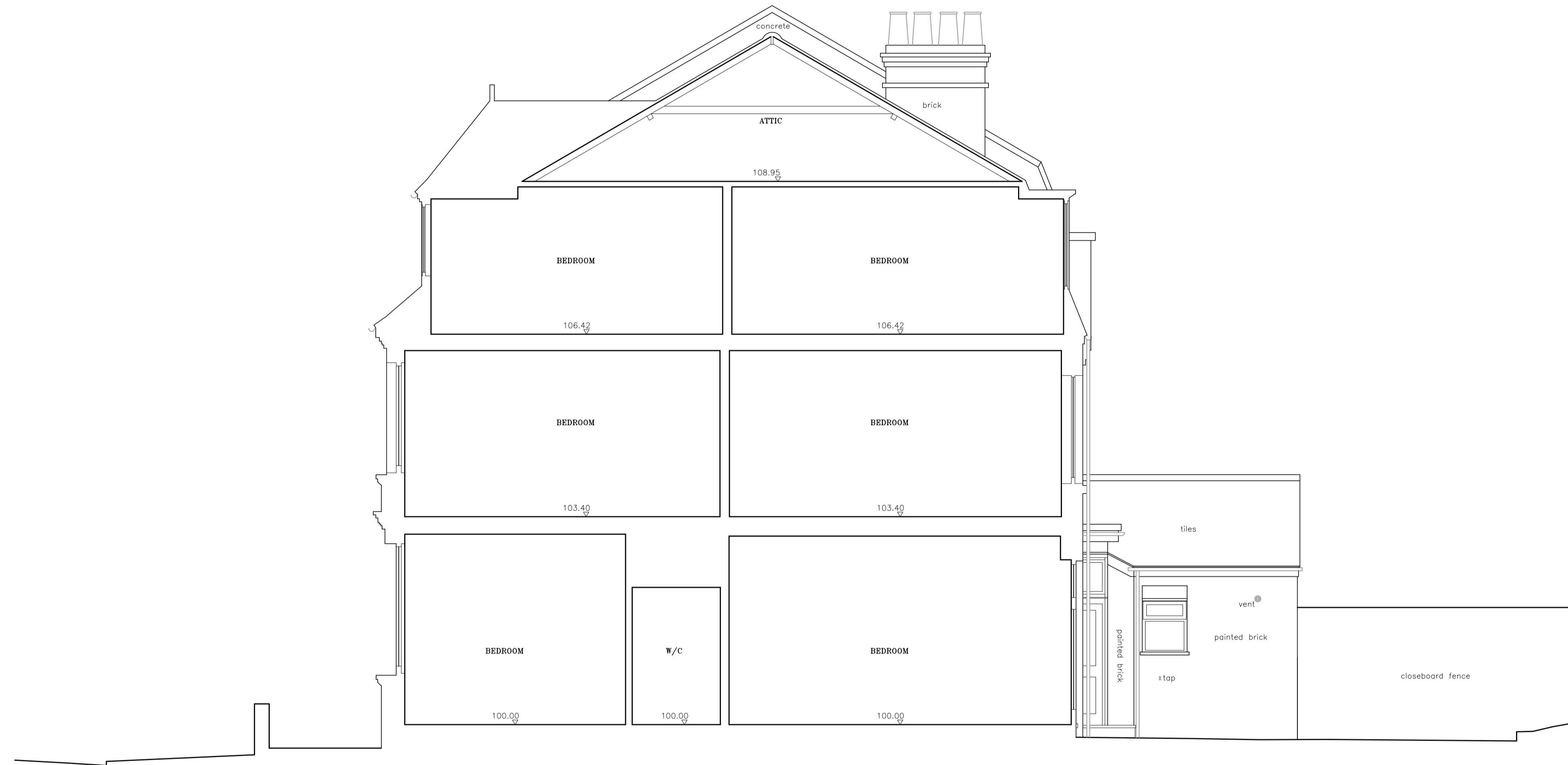
1 Existing Section A 0 1 3m