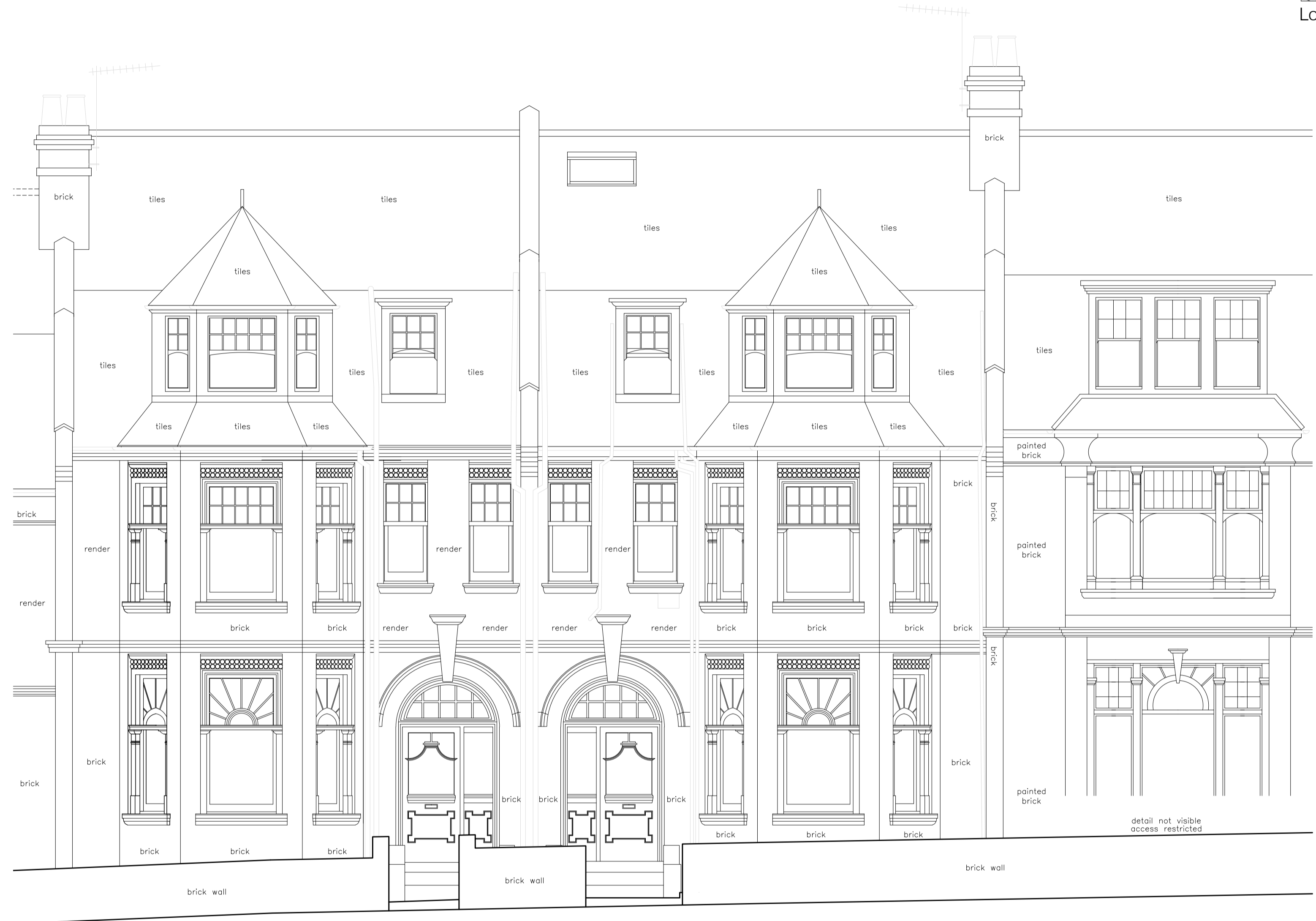
2 Existing Front Elevation 1 0 1 3m