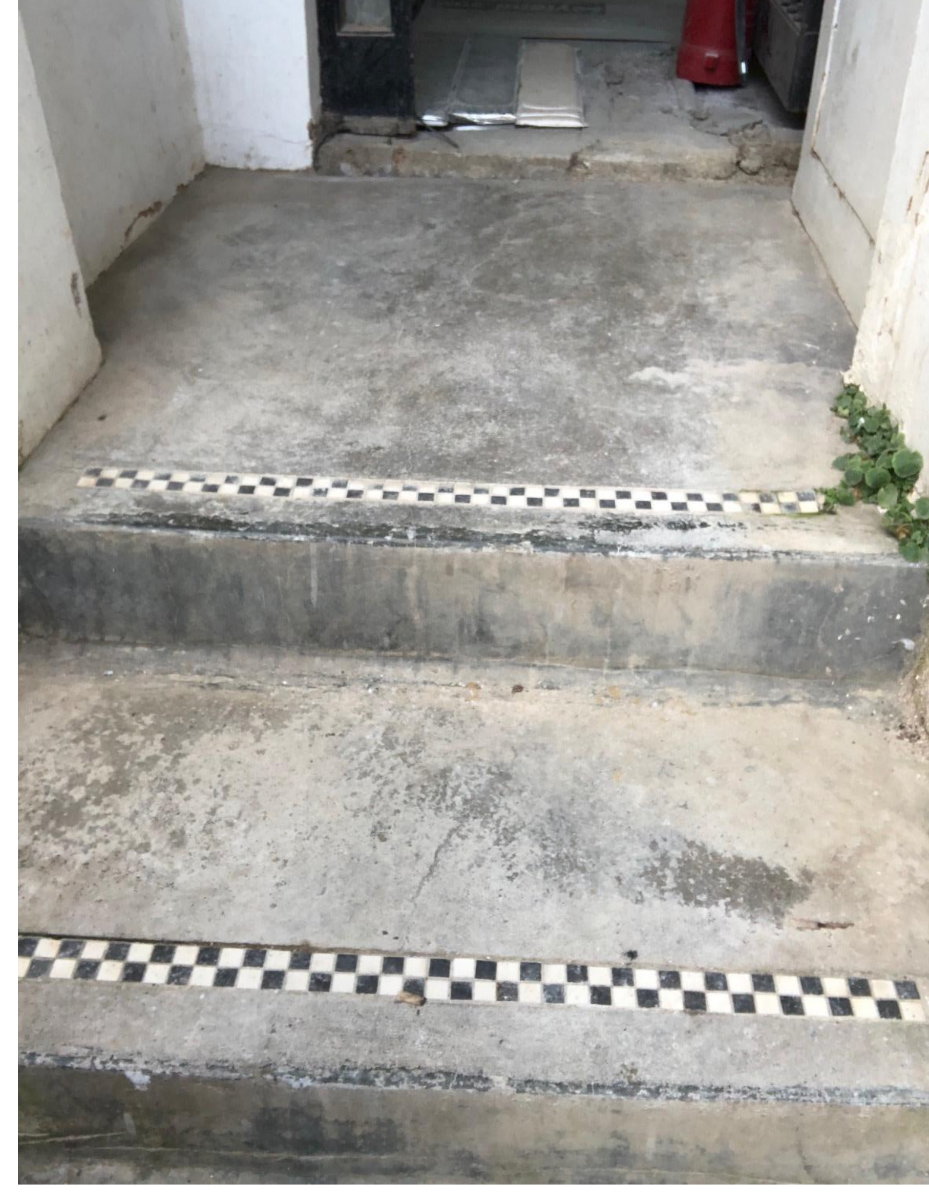
application seeks permission to clad the existing concrete steps with ceramic tiles