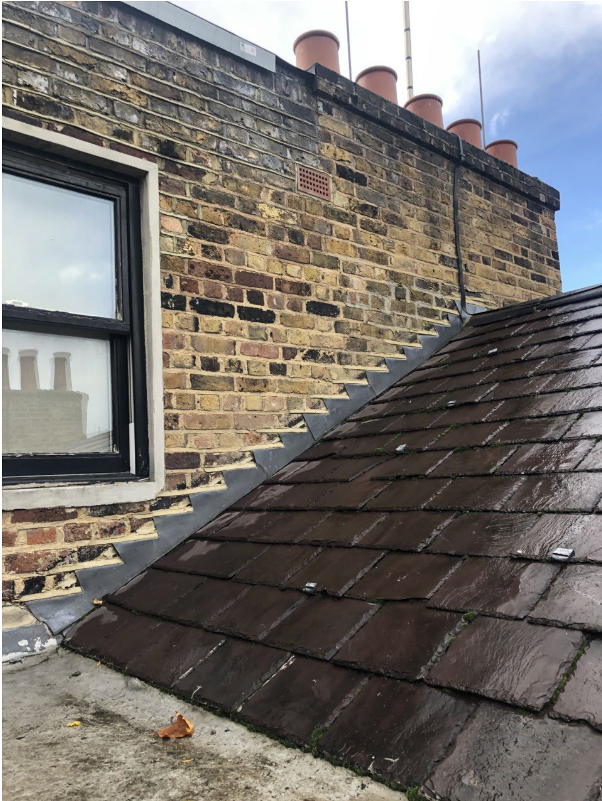
Figure 4 Detail of window built on the boundary with number 69