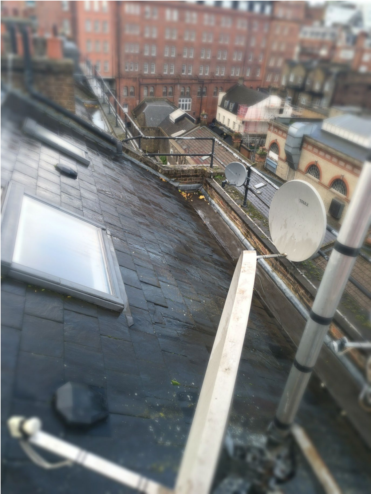
Figure 6Roof at number 69 (adjacent property)