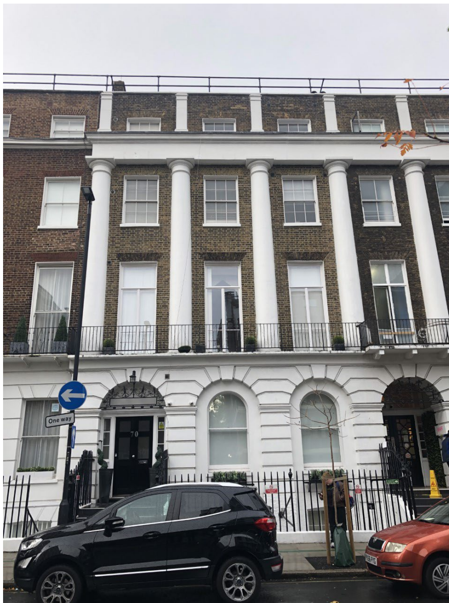
Figure 1 Front Elevation