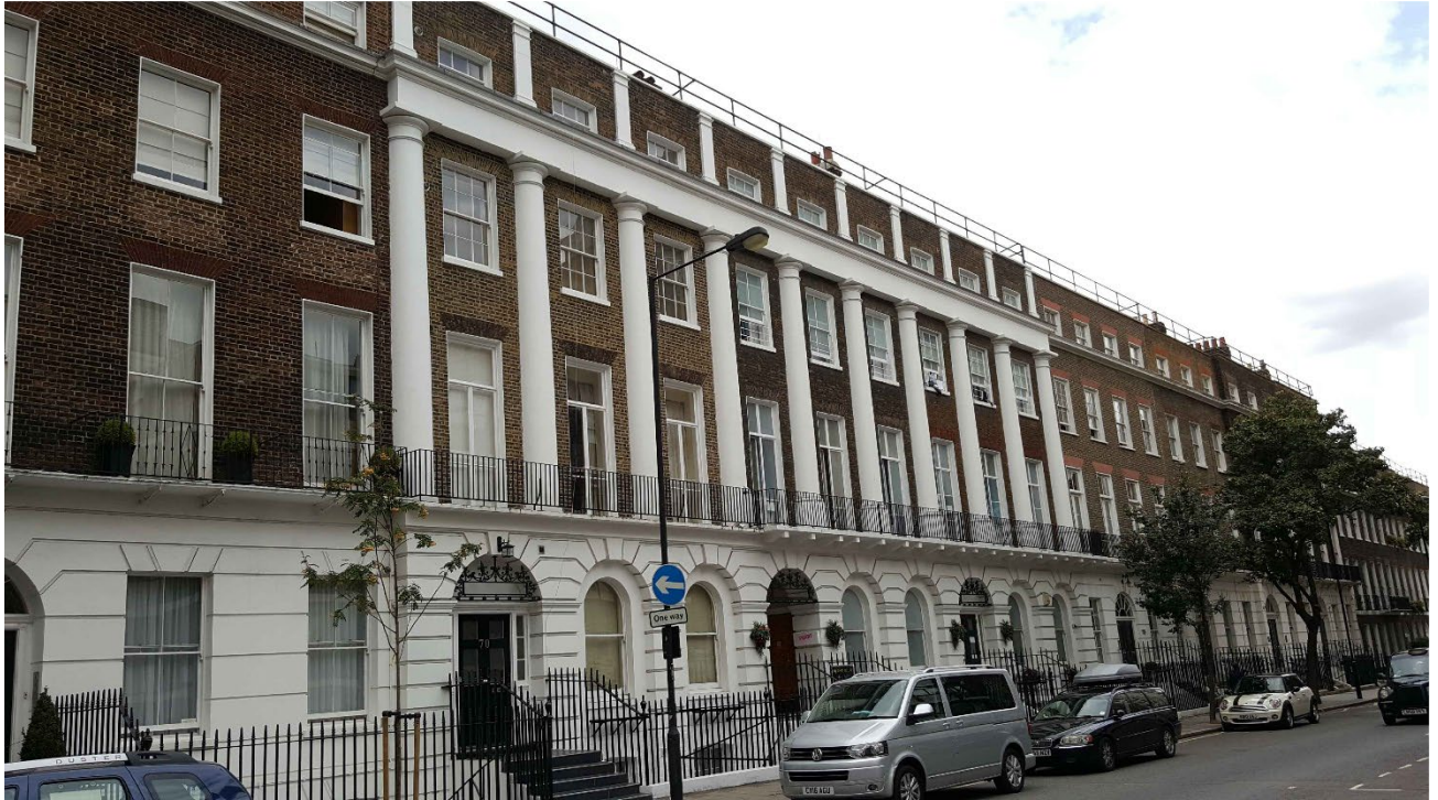
Figure 2 Street Context