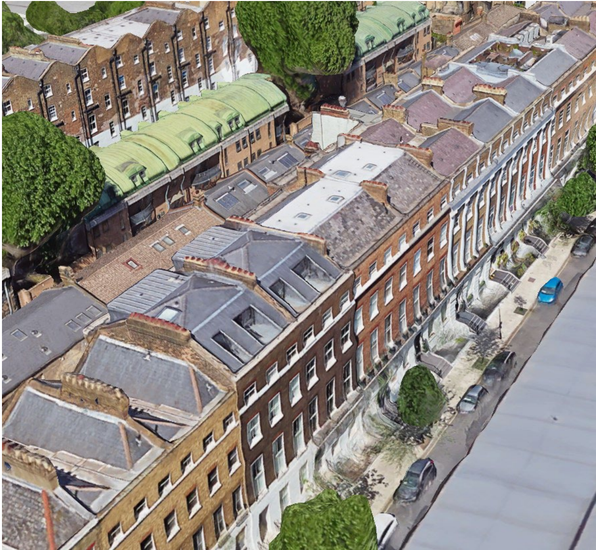
Figure 7 Google view of the adjacent properties