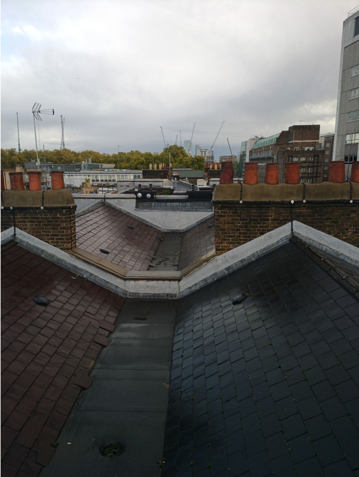
Figure 5 Roof of number 71