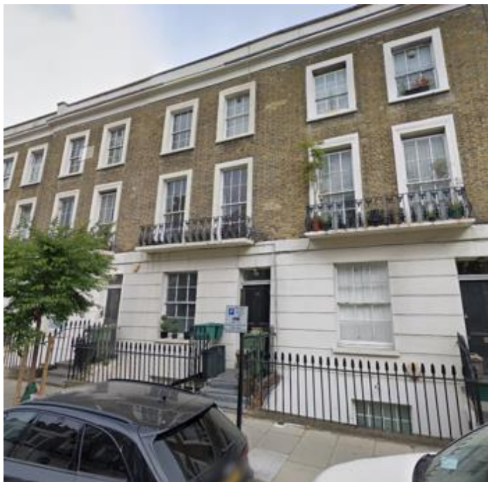
Front elevation of main property