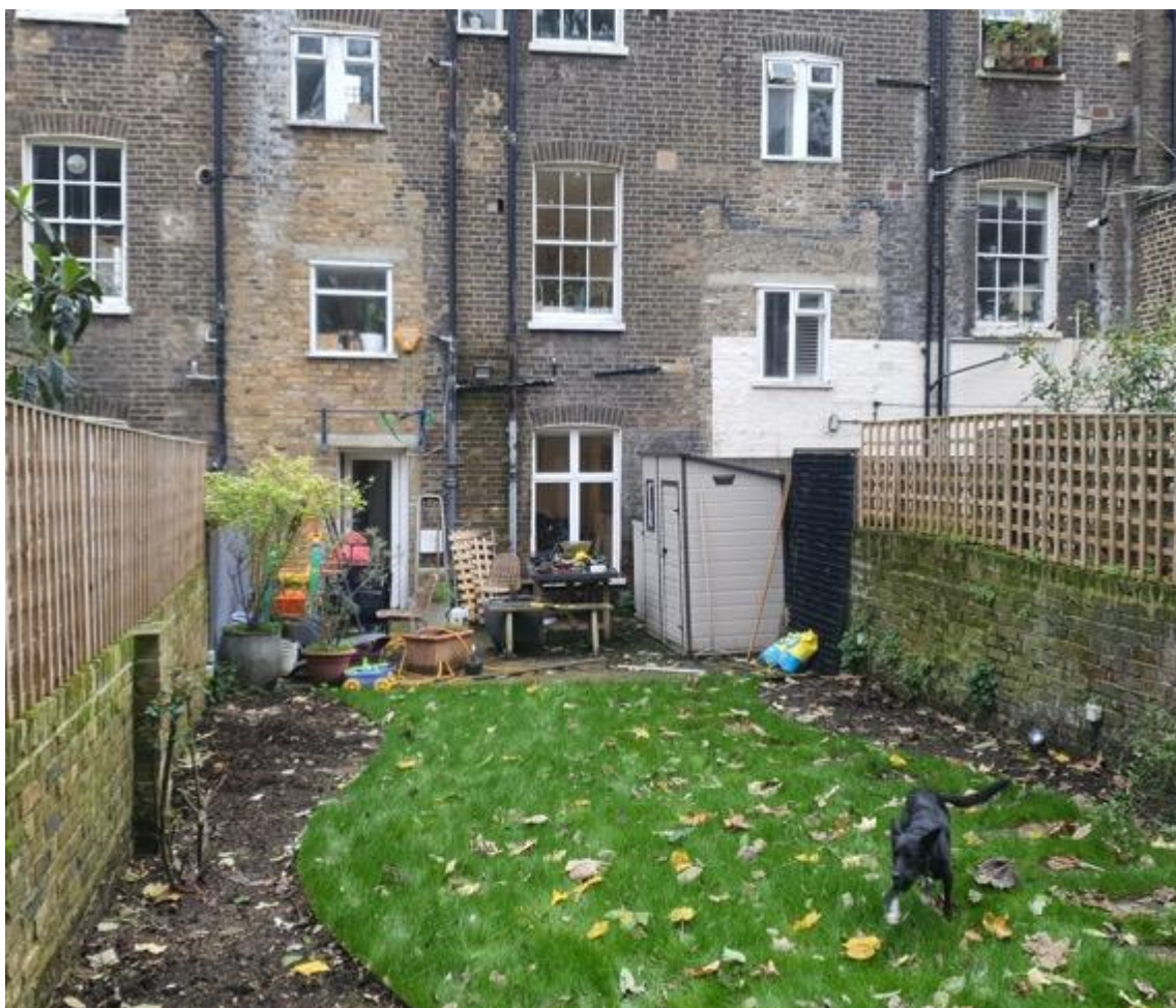
Rear elevation of main house