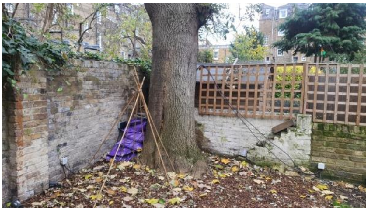
View to 35 Greenland road (from garden of no. 33a)