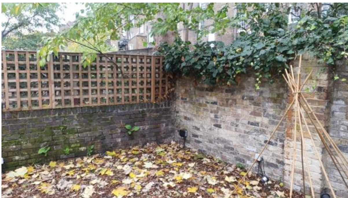
View to 31 Greenland Road (from garden of no. 33a)