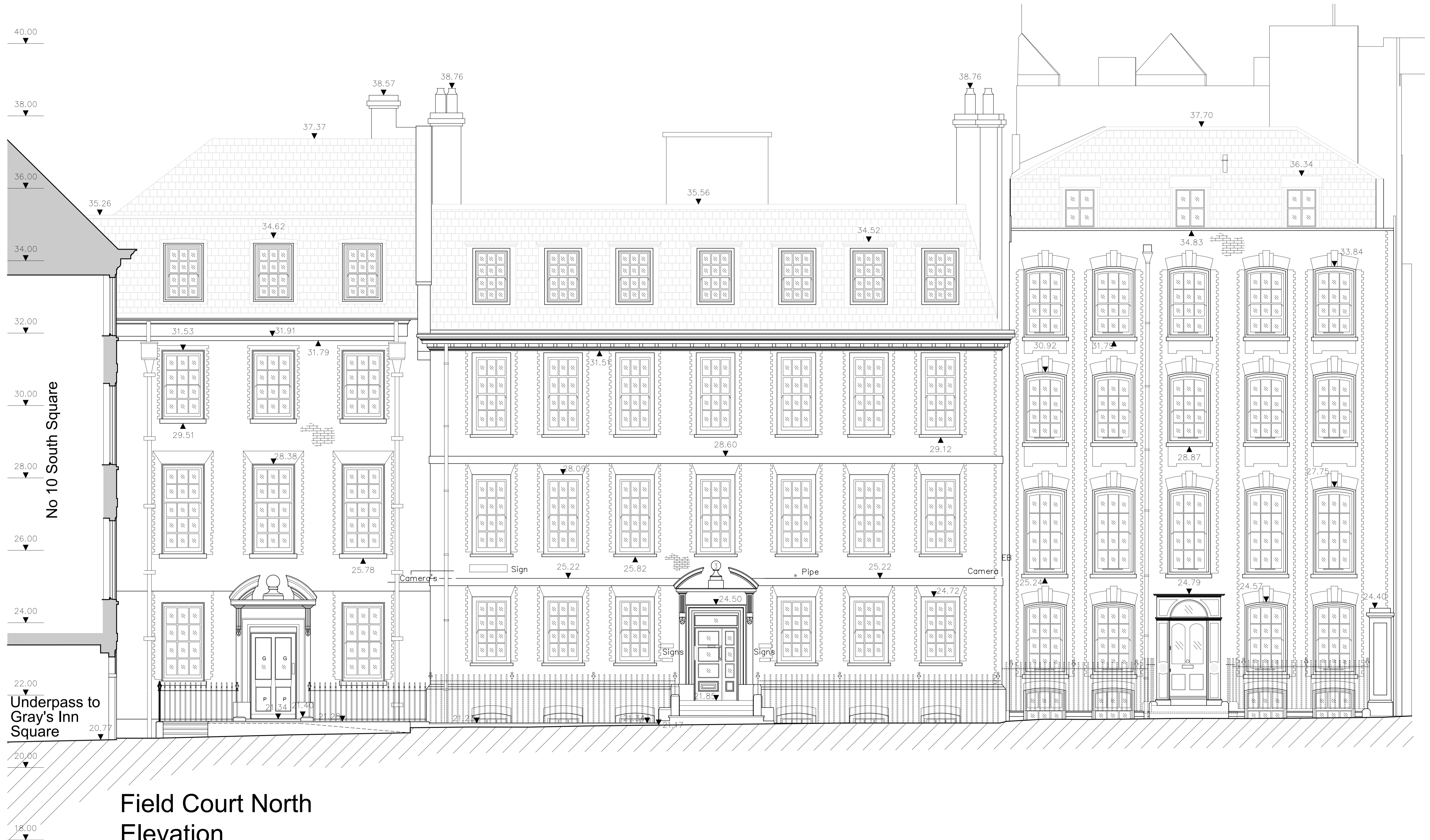
Field Court North Elevation Showing raised area in front of 10A