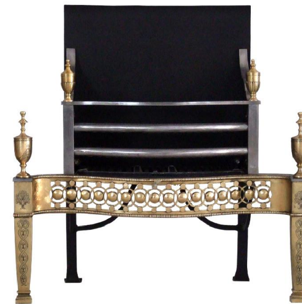
PROPOSED FIRST FLOOR BASKET RECEPTION ROOM