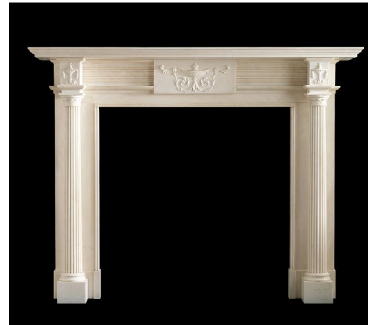
PROPOSED FIRST FLOOR FIREPLACE RECEPTION ROOM

Black Slate Back Hearth Black Slate Slips to suit 40" opening fireplace, Cararra marble surround sizes to be proportional and to match as close as possible to exist.