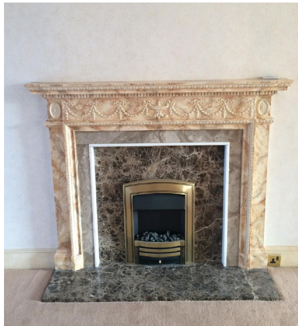
EXISTING FIRST FLOOR FIREPLACE - SCALE 1:20 @ A3 SITTING ROOM FIREPLACE