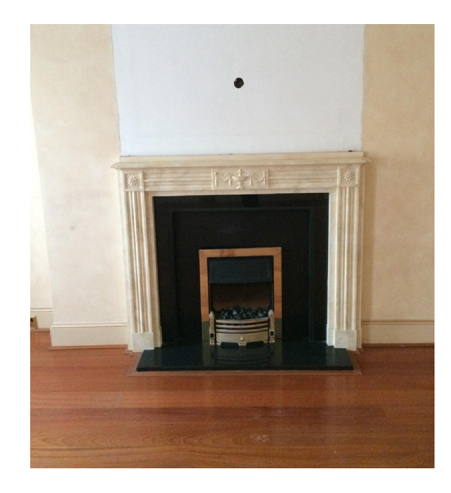
EXISTING GROUND FLOOR FIREPLACE - SCALE 1:20 @ A3 FRONT DAY RM / DINING RM FIREPLACE