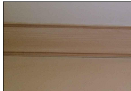
11 EXISTING CORNICE IMAGE THIRD FLOOR TYPICAL THIRD FLOOR