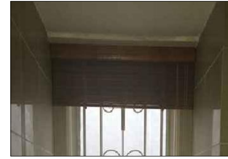
04 EXISTING CORNICE IMAGE GROUND FLOOR EXISTING CLOAK ROOM/WC