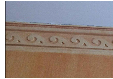
08 EXISTING CORNICE IMAGE SECOND FLOOR EXISTING MASTER CHAMBERS