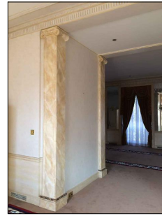
06 EXISTING CORNICE IMAGE FIRST FLOOR EXISTING STUDY