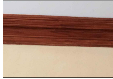
03 EXISTING CORNICE IMAGE GROUND FLOOR EXISTING KITCHEN