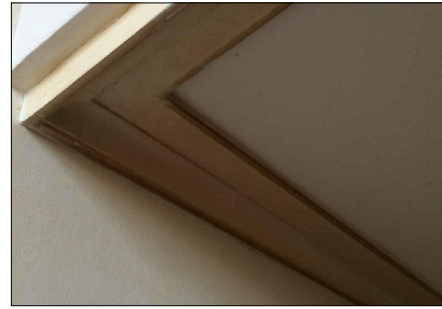
07 EXISTING CORNICE IMAGE FIRST FLOOR EXISTING FIRST FLOOR LANDING