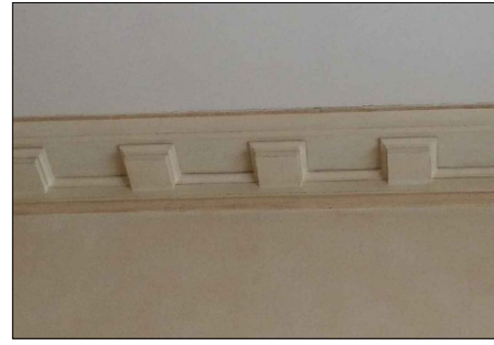
02 EXISTING CORNICE IMAGE GROUND FLOOR EXISTING DINING / DAY ROOM