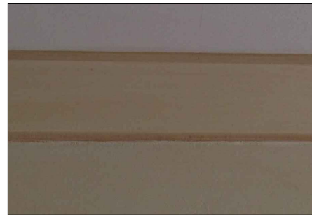
10 EXISTING CORNICE IMAGE SECOND FLOOR EXISTING SECOND FLOOR LANDING