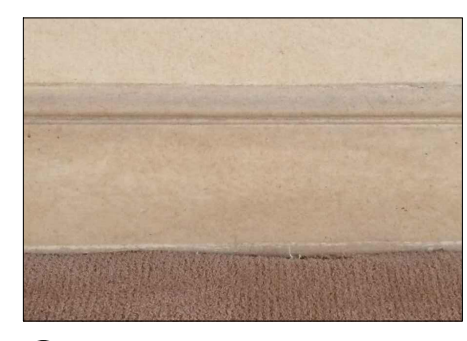
(06) EXISTING SKIRTING IMAGE FIRST FLOOR EXISTING SITTING ROOM (TYPICAL FIRST FLOOR)