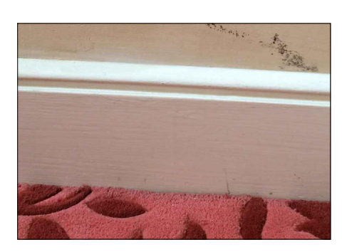
05 EXISTING SKIRTING IMAGE FIRST FLOOR EXISTING FIRST FLOOR LANDING