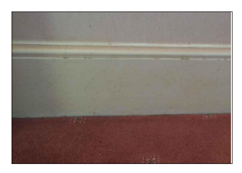
09 EXISTING SKIRTING IMAGE THIRD FLOOR EXISTING THIRD FLOOR LANDING (TYPICAL THIRD FLOOR)