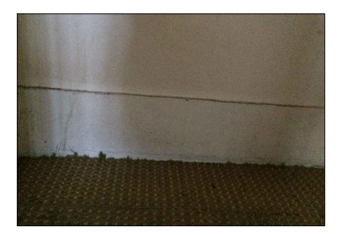
(01) EXISTING SKIRTING IMAGE LOWER GROUND FLOOR EXISTING LOWER GROUND FOYER (TYPICAL LOWER GROUND FL)