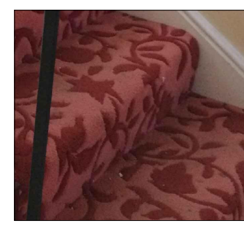
(04) EXISTING SKIRTING IMAGE GROUND FLOOR EXISTING GROUND FLOOR STAIR

(03) EXISTING SKIRTING IMAGE GROUND FLOOR EXISTING DINING ROOM / DAY ROOM