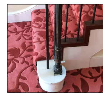
(08) EXISTING SKIRTING IMAGE SECOND FLOOR EXISTING STAIR TO THIRD FLOOR