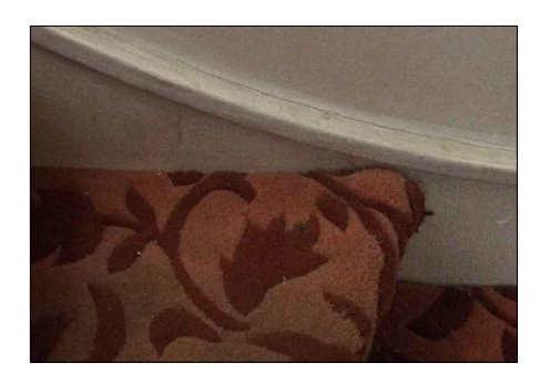
(02) EXISTING SKIRTING IMAGE LOWER GROUND FLOOR EXISTING STAIRWELL