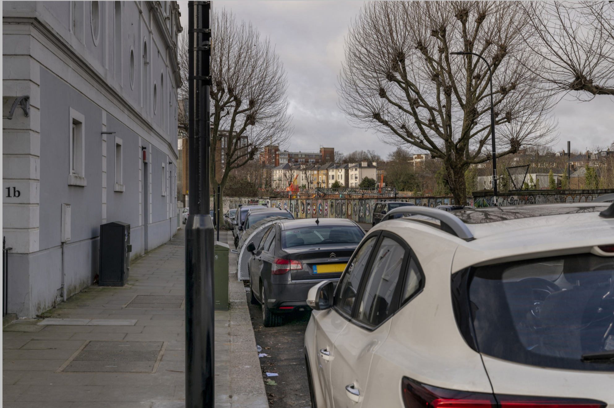
Viewpoint 55 : Year 0 Photography 2023