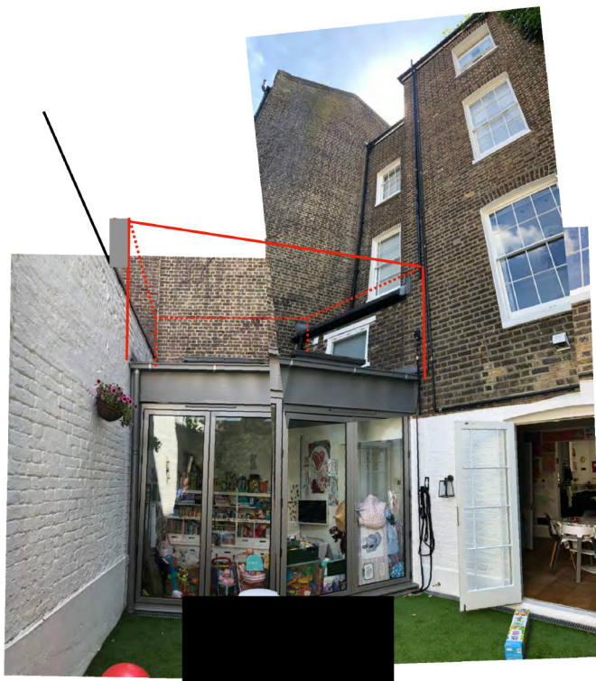
General view of rear yard and Existing closet wing. ( view towards the South )

Red line illustrates extent of Proposed Addition, and additional height required Eastern boundary wall.