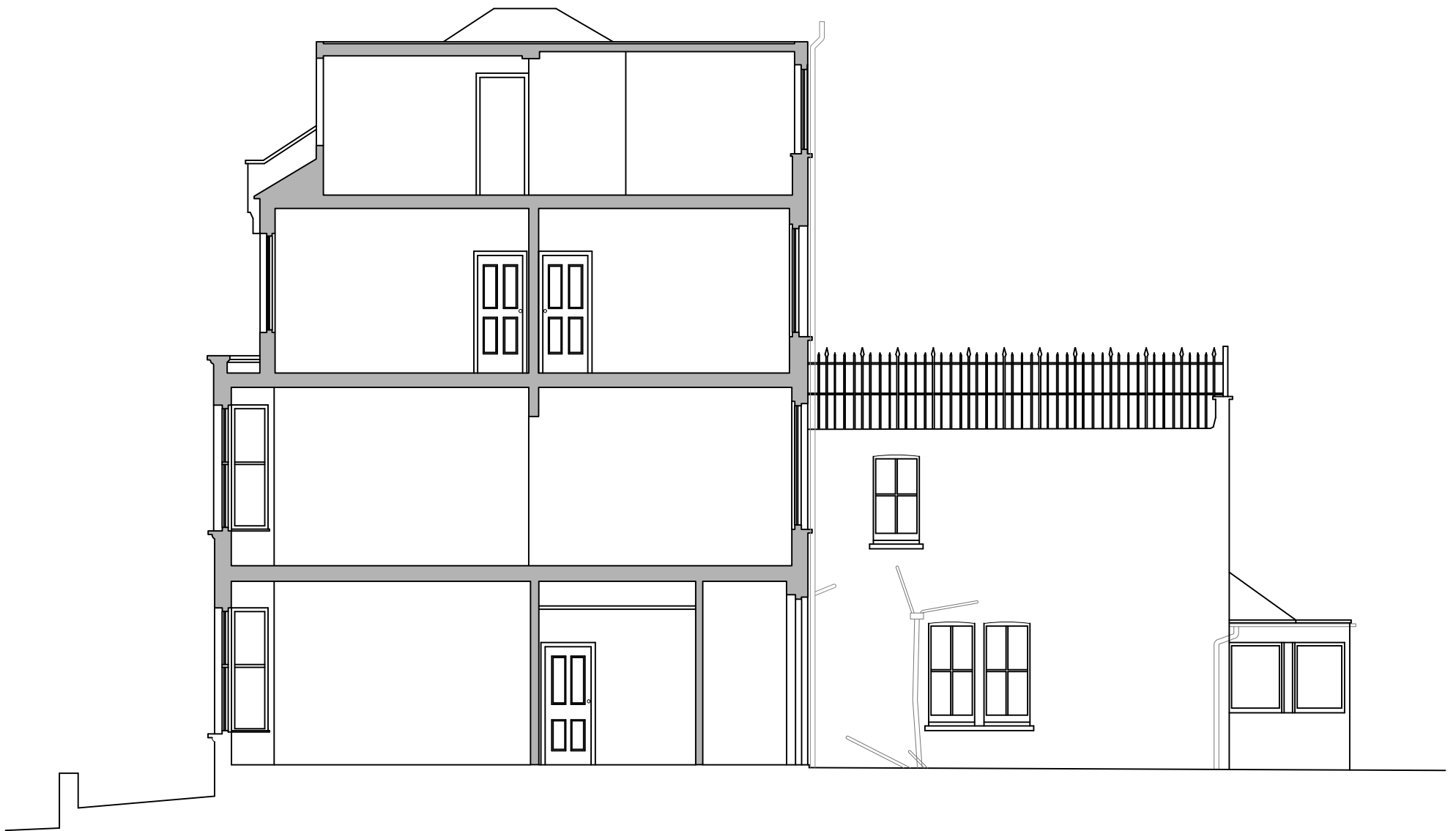
EXISTING SECTION C-C