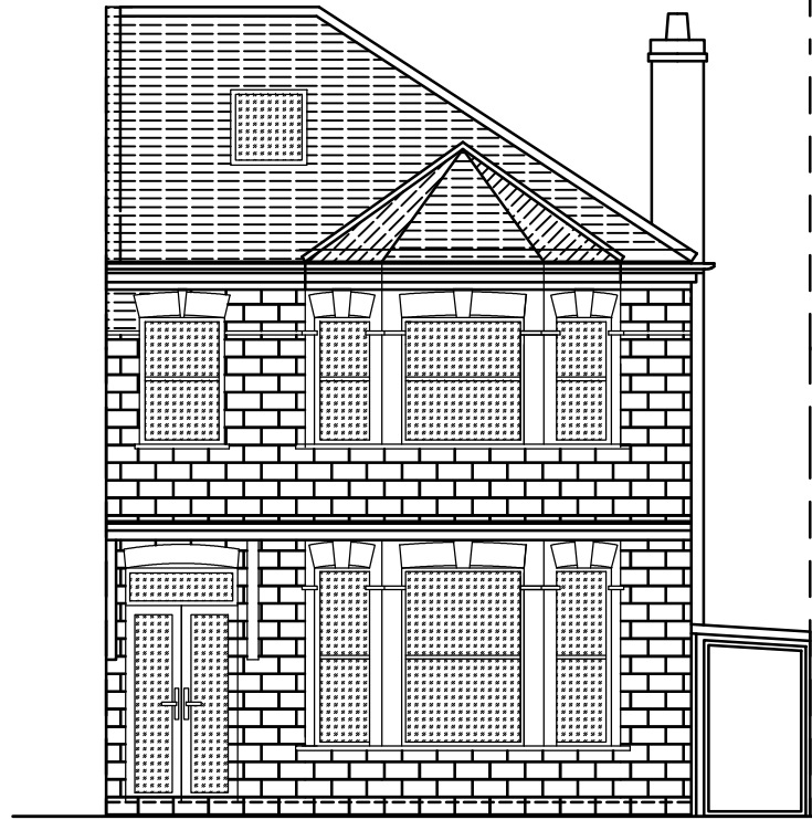
FRONT ELEVATION AFTER LOFT CONSTRUCTION.