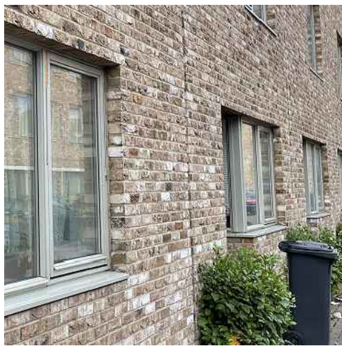
01 - Precedent - TBS London Weathered Yellow Brick