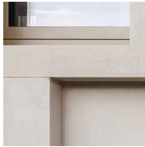
02 - Reconstituted Stone Banding / Window Surrounds to Brickwork Colour: Portland