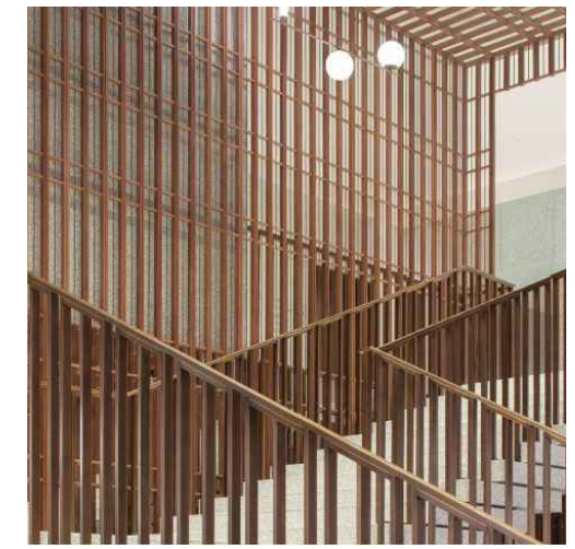
06 - PPC Metal Railings Colour: Bronze RAL 7008