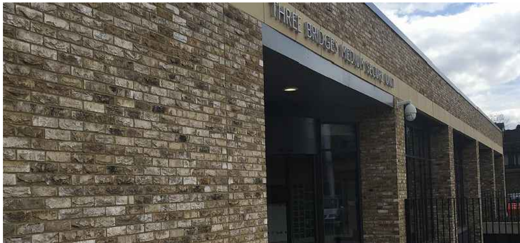
01 - Precedent - TBS London Weathered Yellow Brick