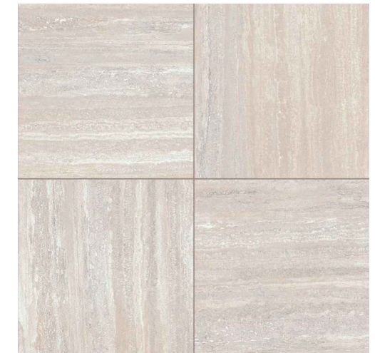
13 - Roof Covering Porcelain Pavers - Travertine Tan Stone