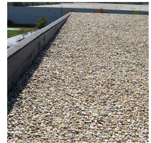
10 - Roof Covering Washed pebbles