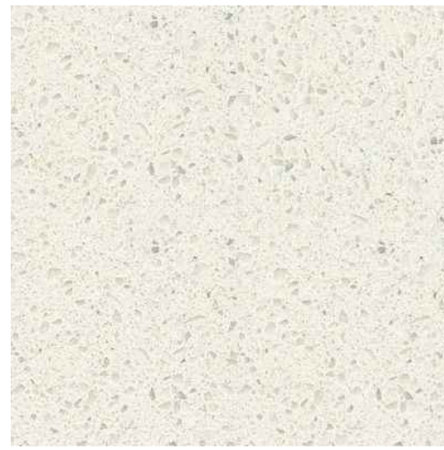
03 - Stone Cladding Panels Domus Facades – Technical Stone – DTS AM 310 – Honed 200