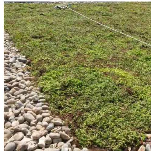
11 - Roof Covering Sedum Vegetation Blanket