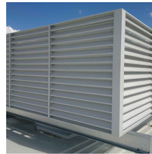
09 - Louvre Plant Screen PPC Aluminium RAL- RAL 7035