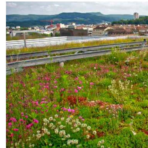
12 - Roof Covering Biodiverse