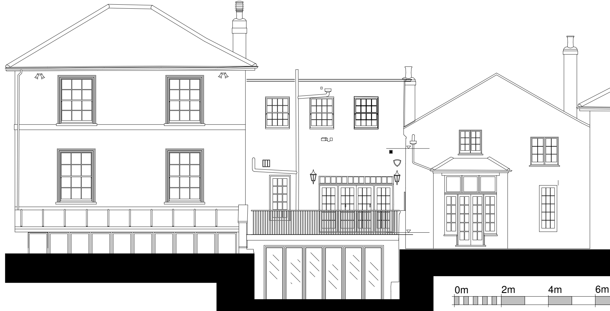
2 Proposed Rear Elevation 1 : 100