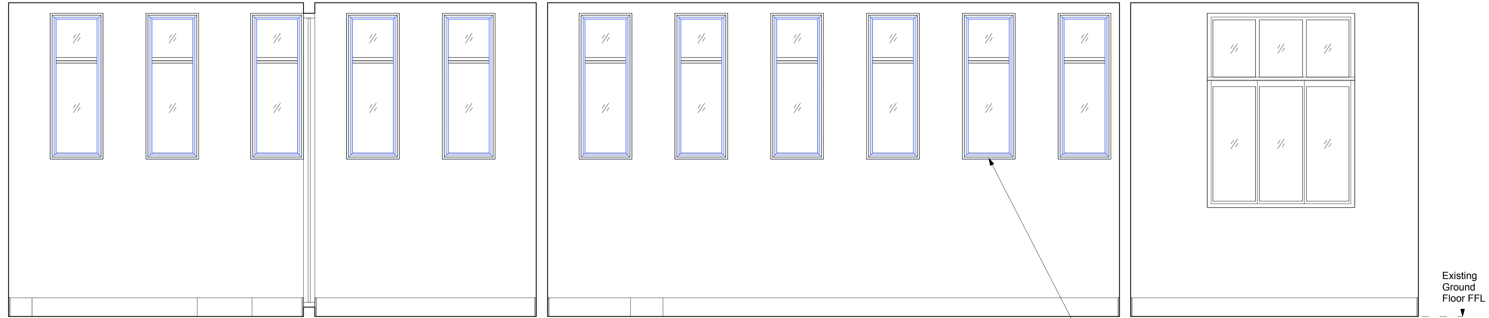
1 Gower Street Proposed Windows Elevation (from inside building) Scale: 1:25@A1

For window locations refer to location key plans (drawing 951/PL/009 - 951/PL/019)