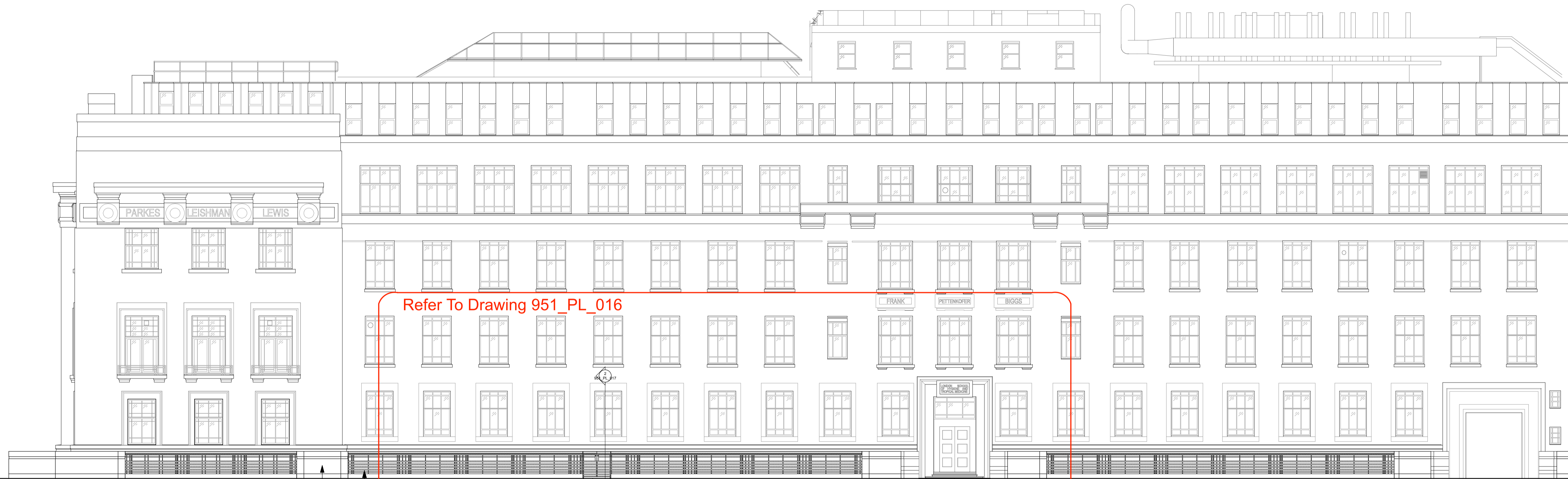
1 Malet Street Proposed Elevation Scale: 1:125@A1/ 1:250@A3

Existing metal balustrade. Existing low level stone wall.