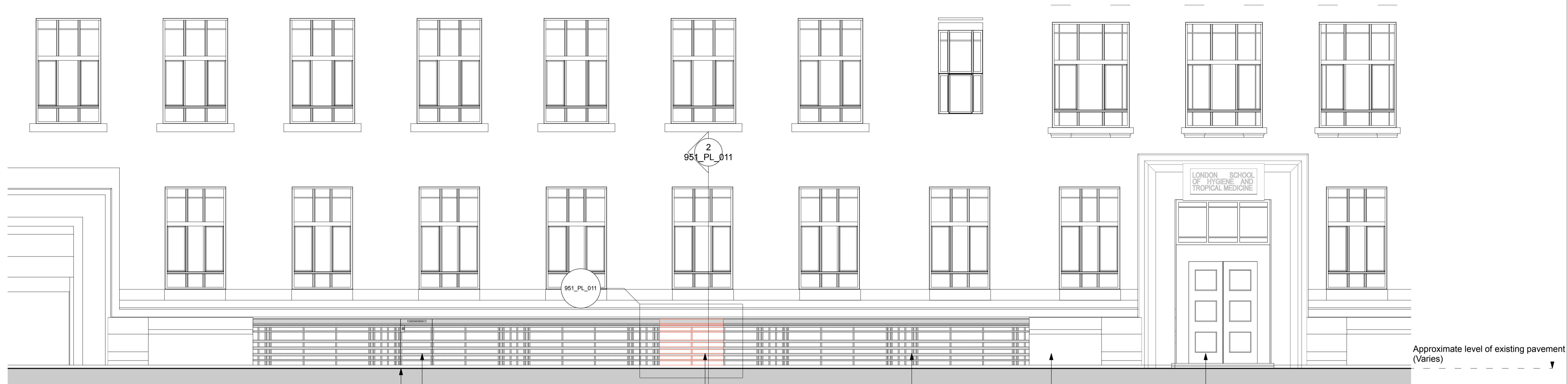
1 Gower Street Existing Part Elevation Scale: 1:50@A1/ 1:100@A3