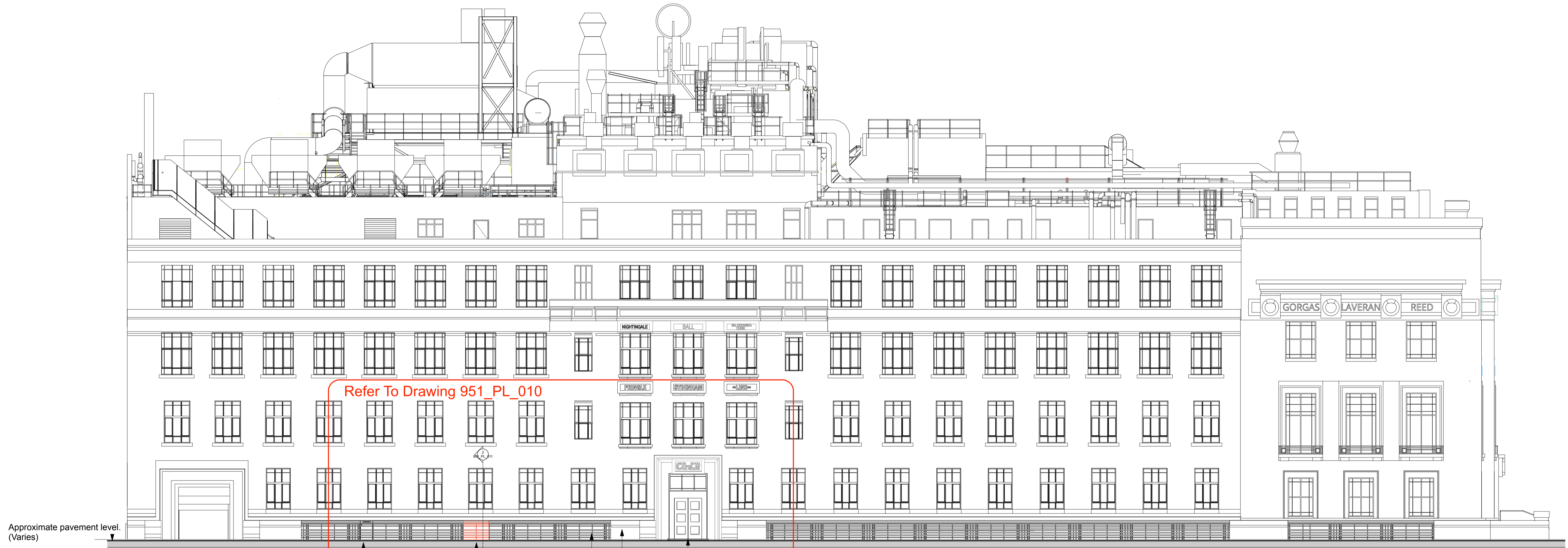
1 Gower Street Existing Elevation Scale: 1:125@A1/ 1:250@A3

Existing unused 'light goods' delivery gate within balustrade.