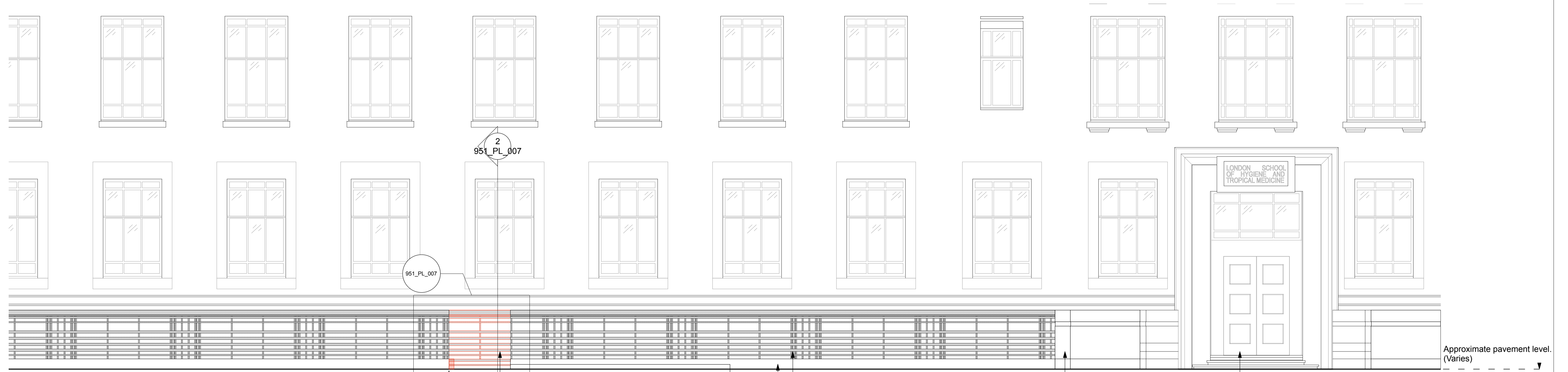
1 Malet Street Existing Part Elevation Scale: 1:50@A1/ 1:100@A3