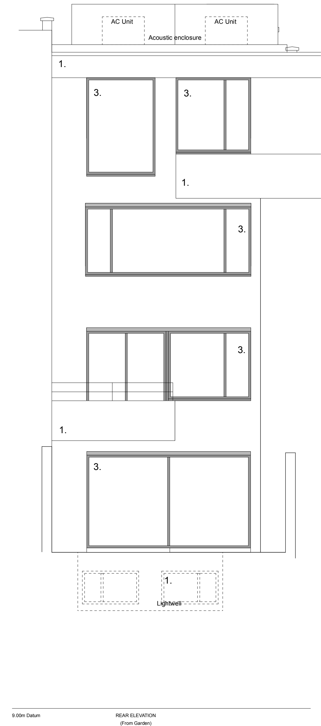
Proposed Rear Elevation 03