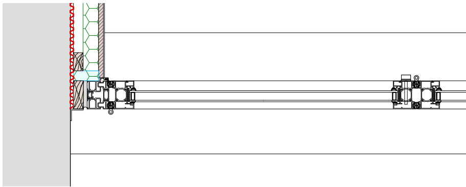
2 Plan 1:10