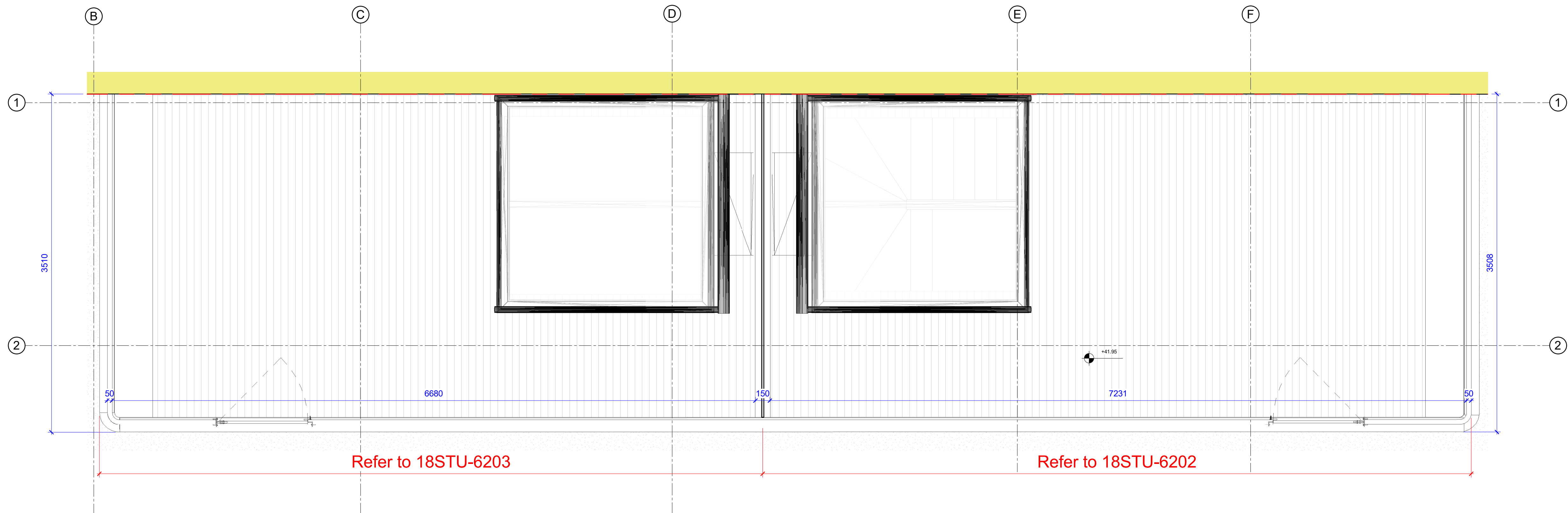
1 Roof Metal Railing - Plan 1 : 25