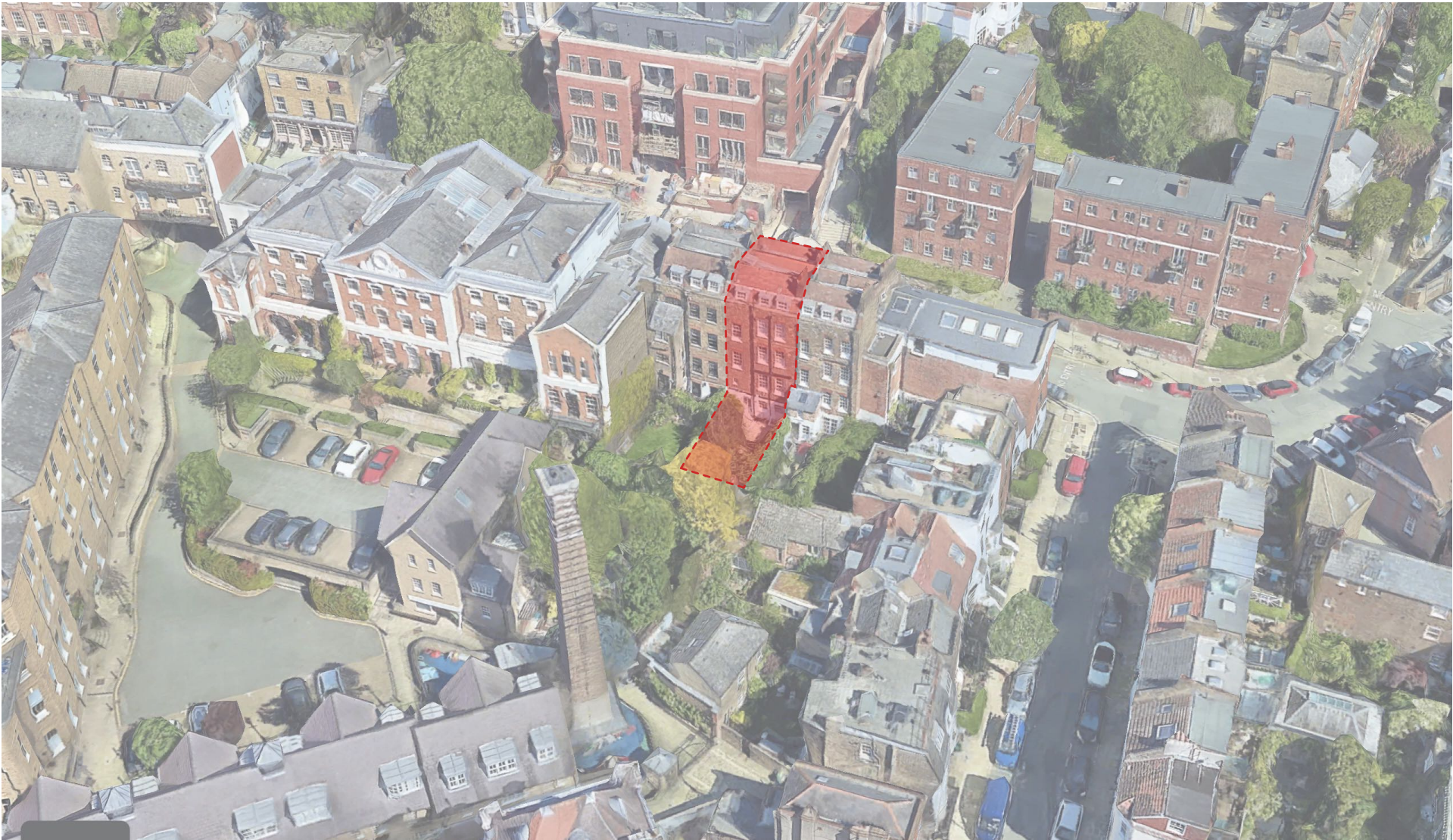
02. AERIAL VIEW OF 12 NEW REAR ELEVATION - nts (No 12 New End outlined in red)